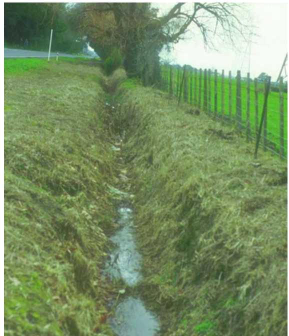
Figure 13 Good mudfish habitat – an unmanaged drain