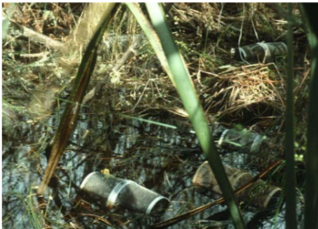
Figure 11 Minnow traps set in a wetland

The traps should be set with the openings of the entry cones just below the water surface; the rationale is that, when the fish are feeding at the water surface at night, they are directed into the trap. Setting the trap at this level also provides an air space to allow the trapped fish to gulp air at the surface. If an air space is not provided, the fish will drown if the water oxygen concentration is too low, as is often the case in swampy environments. Traps do not need to be baited. While some researchers swear by the use of vegemite or bread as bait, unbaited traps catch just as many fish.