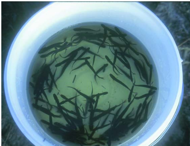
Figure 12 Mudfish can be locally abundant – a single night's catch of Northland mudfish from 15 minnow traps.

All of our mudfish species face an uncertain future, although none of them can be considered endangered in the same way as kakapo or the giant panda. These latter species are endangered because there are only very few individuals left. But even our rarest mudfish, the Northland mudfish, can be very abundant at the few sites where it is found.