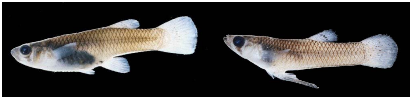
Figure 14 Mosquitofish, Gambusia affinis – 50 mm adult female (left) and 30 mm adult male (right)

Mosquitofish are now classified as unwanted organisms in New Zealand, meaning that it is illegal to release, spread, breed or sell them.