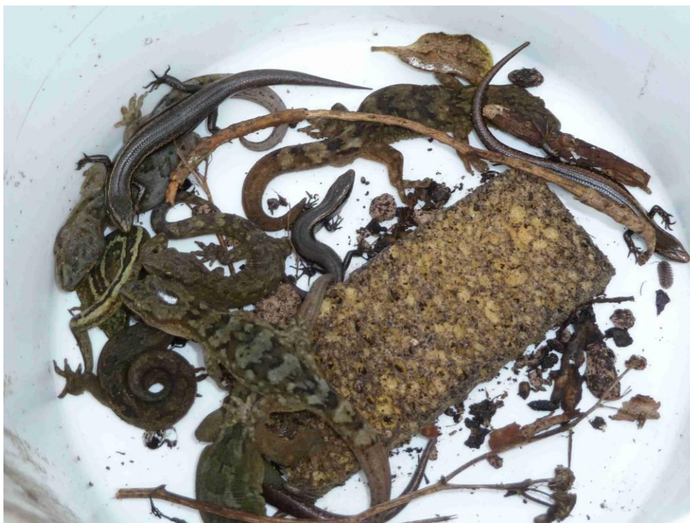
Figure 4. Skinks and geckos within a set pitfall trap. The trap has a large moistened sponge to provide moisture and some debris in the bottom for cover. The bait has been eaten.

Use sticks or other items to raise the cover and create a 1–2 cm space for the animals to pass through. Place the cover so that it fully shades the inside of the trap, and secure it so it will not blow away in wind and/or rain.