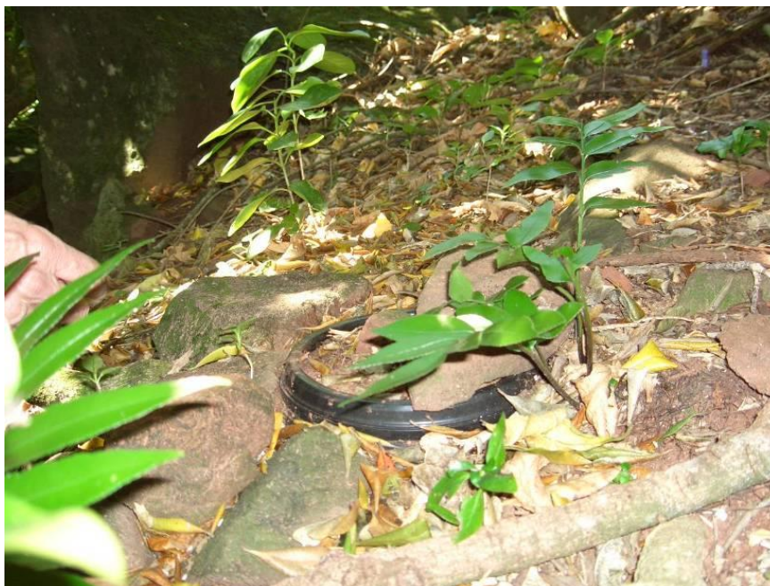
Figure 3. Pitfall traps should lie flush with the ground, so that animals do not have to climb over a lip to fall into the trap. This trap has the lid used as a cover with a rock on top to hold the lid in place.

Using the spade, dig a hole deep enough for the trap. If setting traps on a rocky shore, a spade may be useless and instead a crowbar can be used to lever rocks from the ground (be sure to set traps above the tide mark). If water enters the hole it is not a suitable location for a trap. Set the trap so that it sits flush with the ground and pack substrate around the rim of the container—the animal should not have to climb over a lip to fall into the trap (Fig. 3).