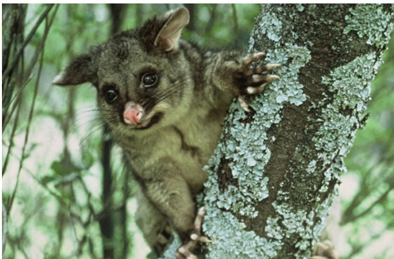
Possum in tree.

Possums eat mainly leaves (most often from our native trees). They will also eat the eggs and chicks of many native birds, such as kererū, kiwi and tūī, as well as native invertebrates like wētā and large land snails. Possums can do a lot of damage to New Zealand native animals and plants.