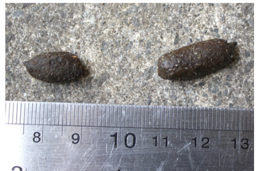
Possum droppings.

Possums were brought to New Zealand in 1837 by people who wanted to farm and hunt them for their fur. What people didn't realise was how many plants, birds and insects possums would eat without any large predators around to eat them.