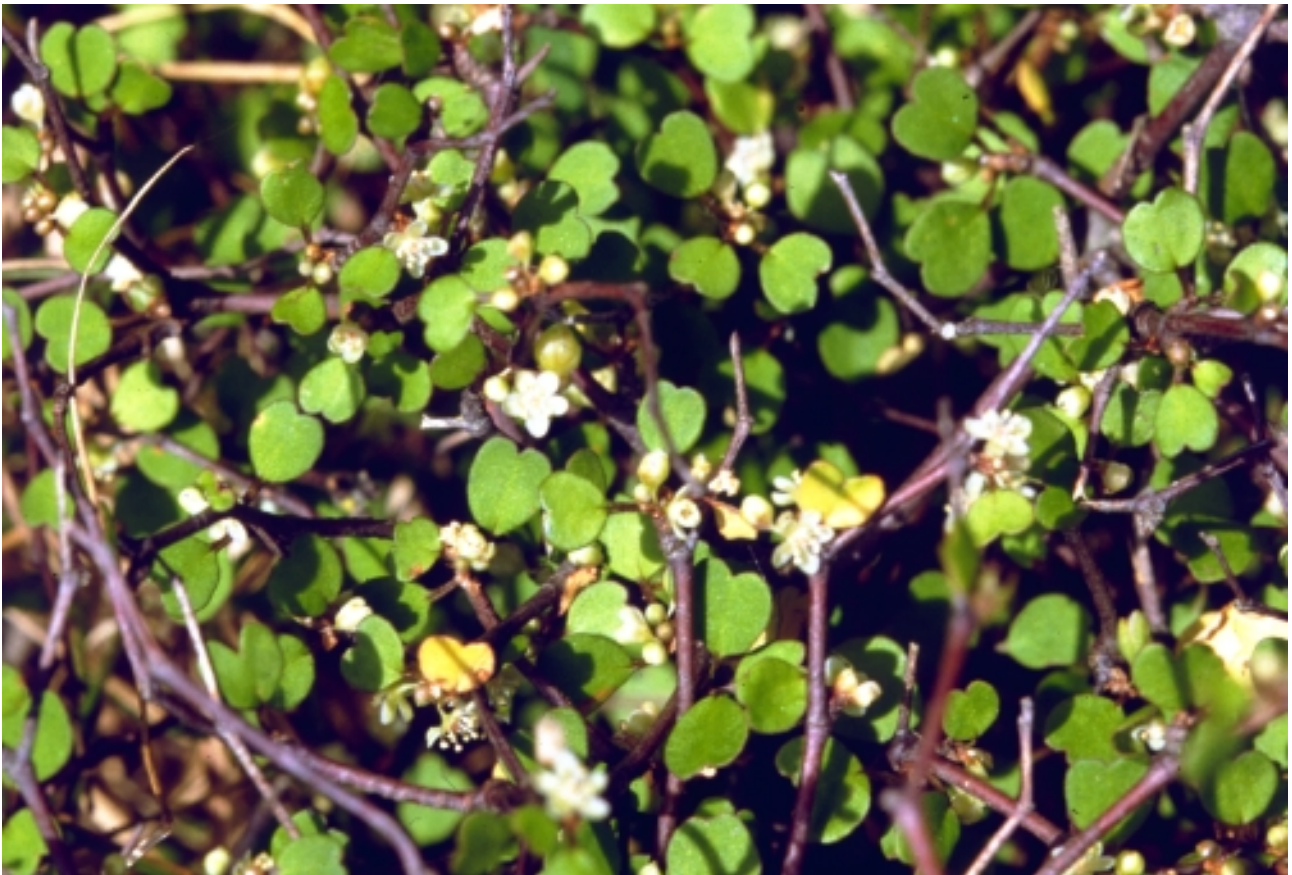
Frontispiece (and cover photo): Shrubby tororaro ( Muehlenbeckia astonii Petrie).