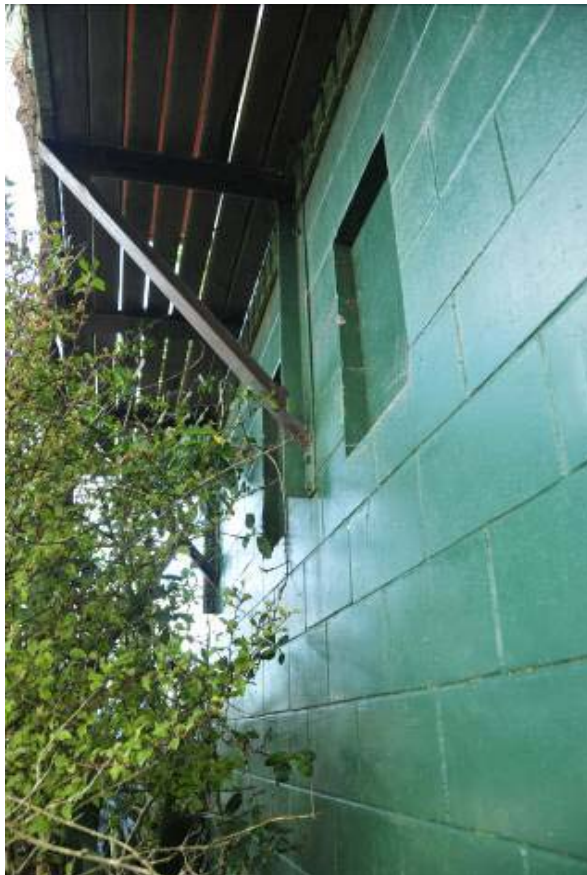
Appendix 2d: The boarded up windows of the lower room (Goddard 2010).