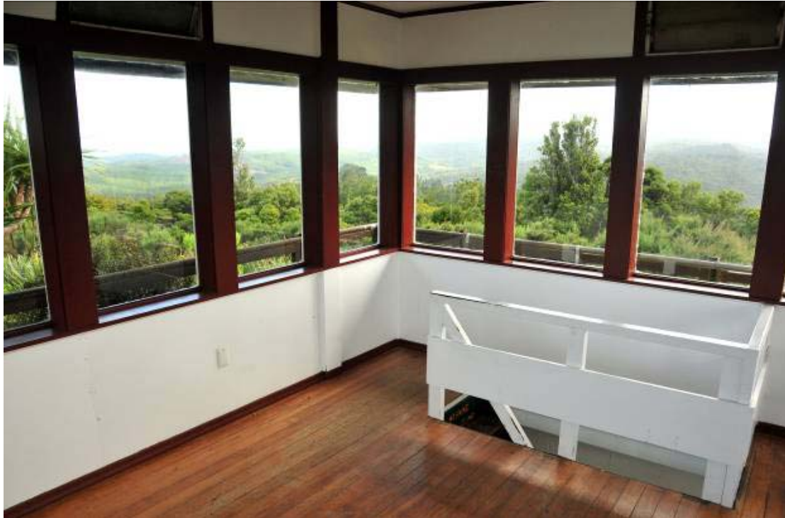
Appendix 2c: The inside of the tower room (Blanshard 2010).