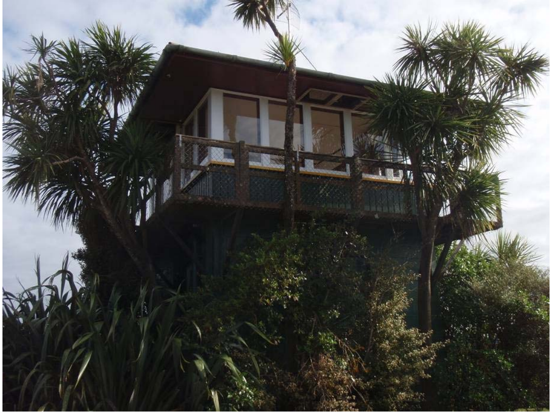
Appendix 2e: The Lookout showing vegetation growth that should be removed to protect the decking (Blanshard 2010).