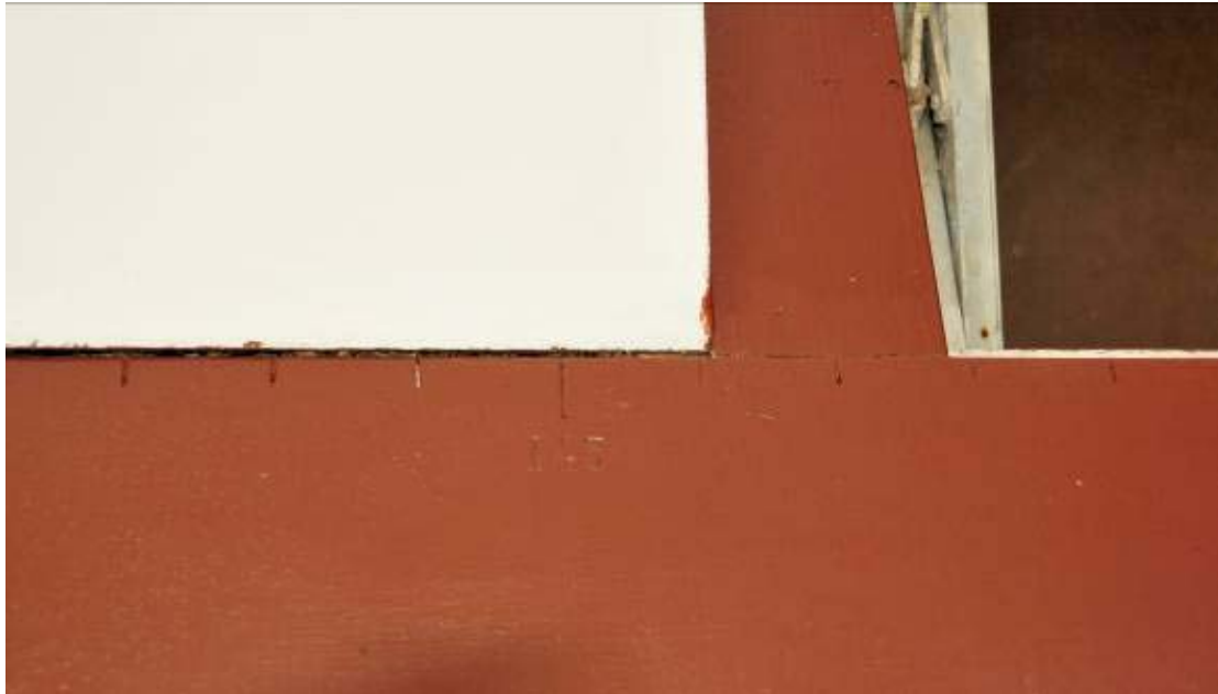
Figure 2: Compass ticks and bearing on the upper window sash of the tower room (Blanshard 2010).