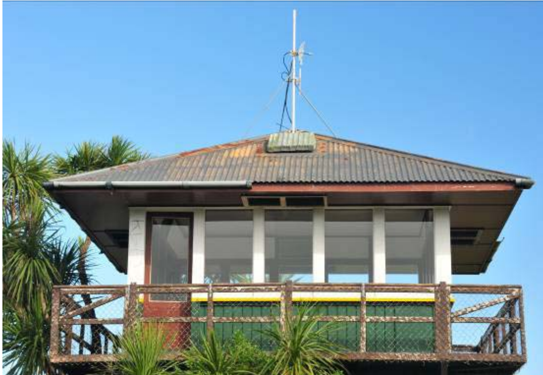
Appendix 2a: The tower room of the lookout (Blanshard 2010).