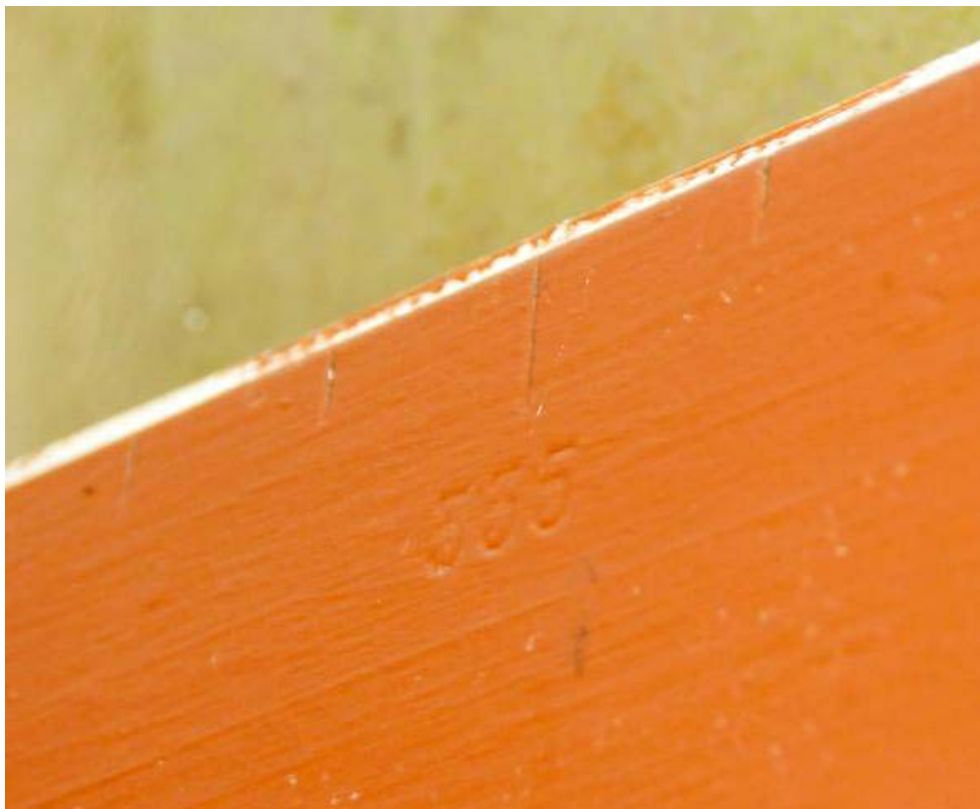
Figure 1: Image of inner compass ticks and bearings on the upper sash of the windows

The tower is part of Northland's built heritage and is in relatively good condition. The basic structural elements are a tower room with wrap around decking and windows (see appendix 2a, b, c), and a lower room which is boarded up, possibly the ablutions room (see appendix d). The date of construction based upon the materials used and the technique is estimated to be mid to late 1950's. This is also confirmed by the correspondence with the Conservator of Forests regarding plans for building the lookout. An assessment conducted by DoC in 2010 gives an overall condition report on the lookout. 3 It has had recent repair work to the windows to keep it weatherproof and the windows have been recently replaced since they were broken by vandals. Part of the ceiling is beginning to sag and there have been two instances of vandalism to the inside paintwork. There has been a recent addition of an antenna to the roof done without DoC consultation. 4 The whole structure cannot be viewed at present as the lower room is boarded up. This room appears to be plumbed and is probably an "ablution room". It would be beneficial to open this up to confirm its function. The groove in the ground surface leading from the structure is probably an old drain associated with the Lookout. There are compass marks going around the upper window sashes that are unique to the building (figure 1 and 2). These were used to take bearings on fire locations.