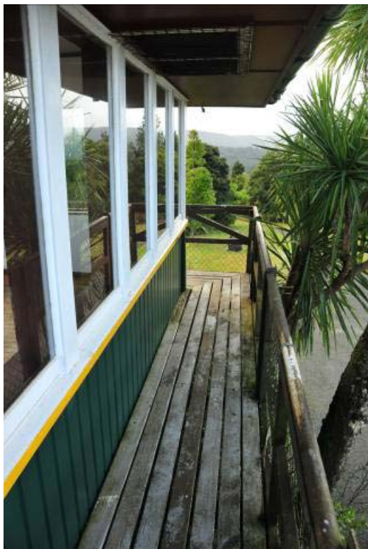
Appendix 2b: Part of the wrap around deck (Goddard 2010).