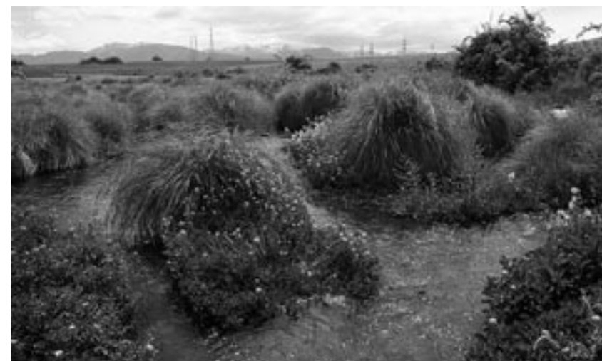
Fig. 44 A spring-fed stream near Twizel, inland Canterbury, where lush growth of herbs on the margins is indicative of a constant flow of well-aerated water and a moderate supply of nutrients.