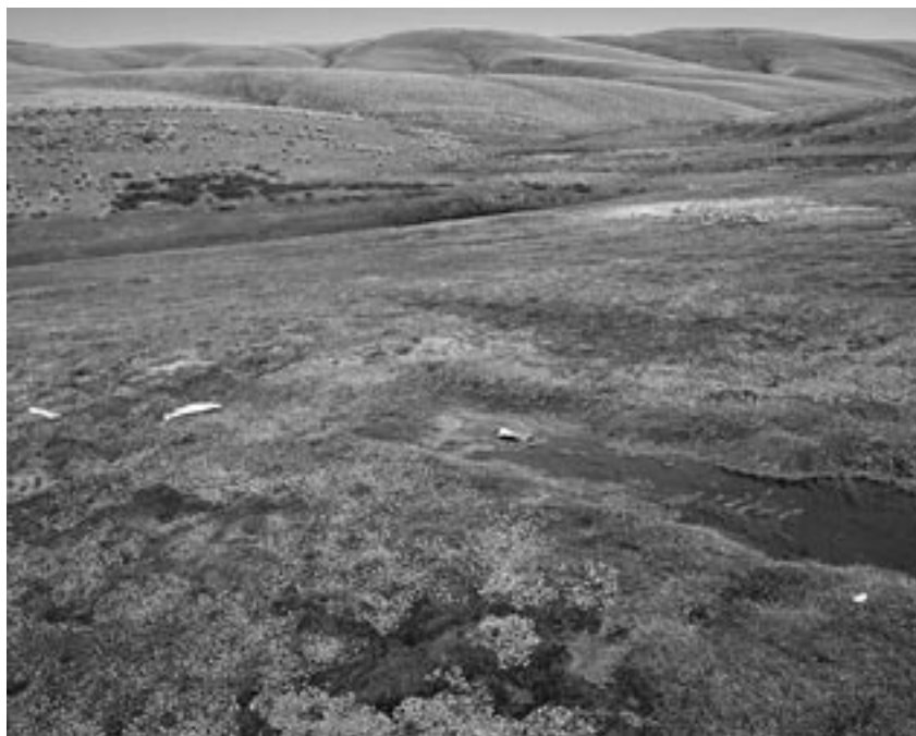
Fig. 45 Part of a fen on the Lammerlaw Range, Otago, where an upwelling of groundwater is producing a raised 'pustule', bright green from lush herbs and liverworts, that is more fertile and better aerated than the surrounding sedgeland. The soft peat of such sites can be a trap for animals, such as the cattle beast whose remains are visible in this pool.

Seepages occur in many different situations, ranging from drip-channels on cliffs, to the splash-nourished sides of steep streams and waterfalls (Fig. 46), and to all the places where water oozes from the ground because of a change in slope, a layer of impervious rock, or an iron pan. Many seepages occur in hill and mountain country. A snowbank is a site on a mountainside which accumulates snow, is usually late to thaw, typically has a predominantly mineral substrate, is fully saturated during the weeks or months of snow-melt, yet at other times may be dry (see Fig. 81). Many snowbanks feed seepages that merge with and nourish flushes and fens downslope.