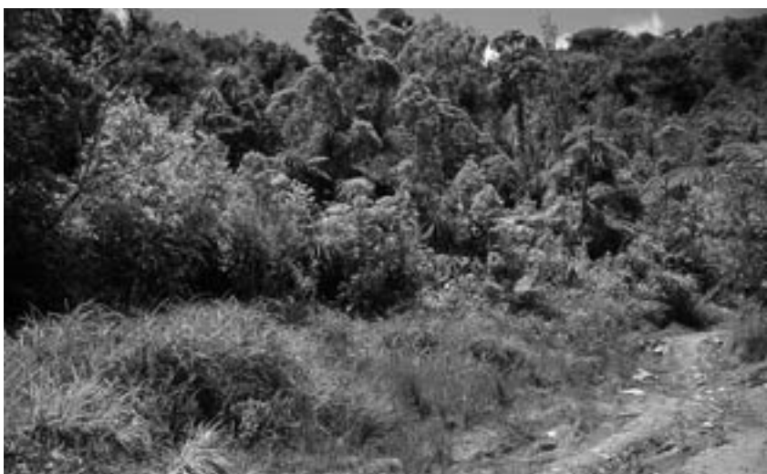
Fig. 50 Forest. Kaimai Range, Bay of Plenty; a hillside where mineral soils carry a flow of groundwater and surface water, evident from the wet sedgeland beside the vehicle track, and responsible also for the pale-green patch of pukatea ( Laurelia novae-zelandiae ) forest seepage; palustrine.