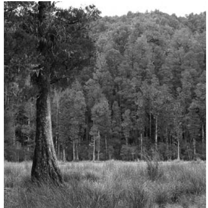
Fig. 48 Forest. Arahaki Lagoon, Whirinaki, Volcanic Plateau; a depression upon volcanic ash (see soil profile, Fig. 131) where periodic ponding inundates the surrounding forest: kahikatea ( Dacrycarpus dacrydioides ) forest ephemeral wetland; palustrine.

The following illustrations of wetland types are described in a format that first emphasises the structural class (in bold type), notes the location (refer New Zealand map on inside front cover) and functional setting of the wetland, and then names the wetland type according to its dominant plants, structural class, wetland class, and hydrosystem.