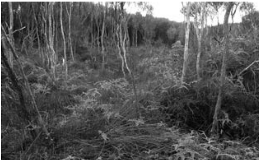
Fig. 54 Scrub. Kopuatai, Hauraki Plain, Waikato; part of the fen that surrounds the bog of the Kopuatai Peat Dome (see also Figs 70, 140 and 141). Spindly manuka, 5–6 m tall, forms a mixture of shrubland (where its canopy cover is less than 80%) and of denser scrub: manuka / tangle fern - wire rush scrub fen; palustrine.