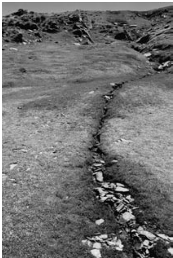
Fig. 42 A flush is a seepage that receives periodic pulses of water. This example, on a relatively steep mountainside, shows how heavy rain events have eroded a surface channel, and also deposited stones and gravel that are being incorporated in the peat, Garvie Mountains, northern Southland.