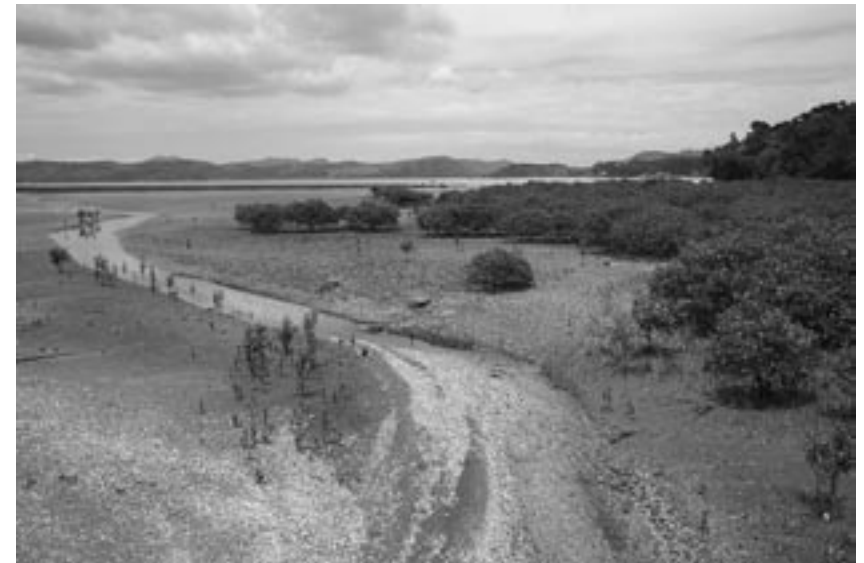
Figs 55 and 56 Scrub. Coromandel Harbour, Coromandel Peninsula; estuary mudflats and shell beds at two stages of the tide: mangrove ( Avicennia marina subsp. australasica ) scrub saltmarsh; estuarine.