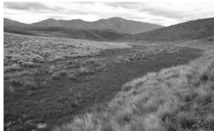
Fig. 61 Tussockland. Glenmore, Lake Tekapo, Canterbury; rolling moraine country with a gently sloping seepage in a stream head, the constantly wet valley floor having Carex diandra sedgeland while the more mineral and less saturated soils of the flanking slopes have Schoenus pauciflorus tussock seepage; palustrine.