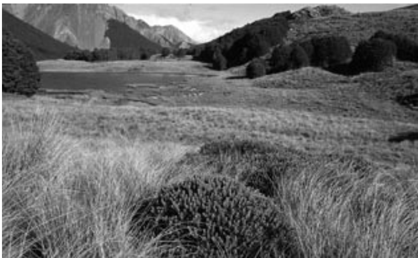
Fig. 59 Tussockland. Lagoon Saddle, inland mid-Canterbury; moist peaty slopes leading down to peat pools in a montane valley head: red tussock ( Chionochloa rubra ) - Hebe odora tussock fen; palustrine.