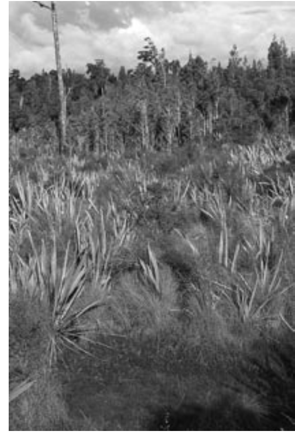
Fig. 58 Flaxland. Mahinapua, Westland; part of a swamp grading from a stream channel (foreground) to kahikatea forest (background): Phormium tenax - Coprosma propinqua flax swamp; palustrine.