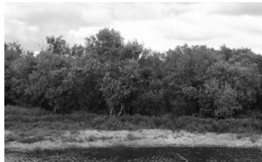
Fig. 51 Forest. Kopuatai, Hauraki Plain, Waikato; a modified area of the Kopuatai Peat Dome, adjacent to one of the major encircling drainage canals; grey willow ( Salix cinerea ) forest fen; palustrine.