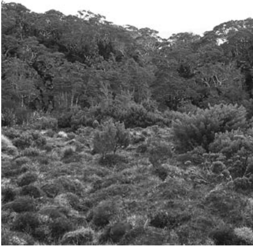
Fig. 57 Shrubland. Longwood Range, western Southland; a hilltop bog set among silver beech ( Nothofagus menziesii ) forest: bog pine ( Halocarpus bidwillii ) / Donatia novae-zelandiae shrub / cushion bog; palustrine.