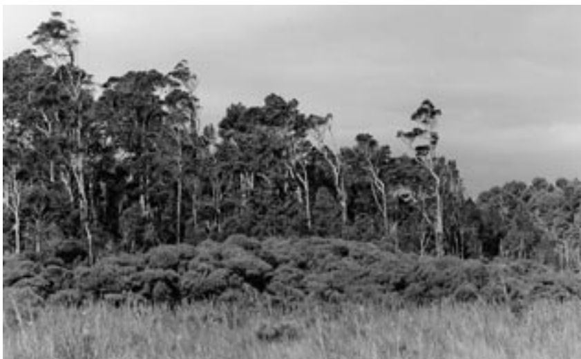
Fig. 49 Forest. Waitangiroto, Westland; a lowland fen where sedgeland grades to a fringing zone of manuka scrub then silver pine ( Lagarostrobos colensoi ) forest bog; palustrine.