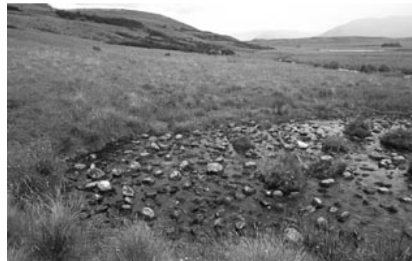
Fig. 43 A spring, where water emerges from the ground as a point source (left) on the side of the Ahuriri Valley, northern Otago. The stable stream margin and the tufts of vegetation upon stream stones are indicators of constant flow and an absence of scouring sediments.