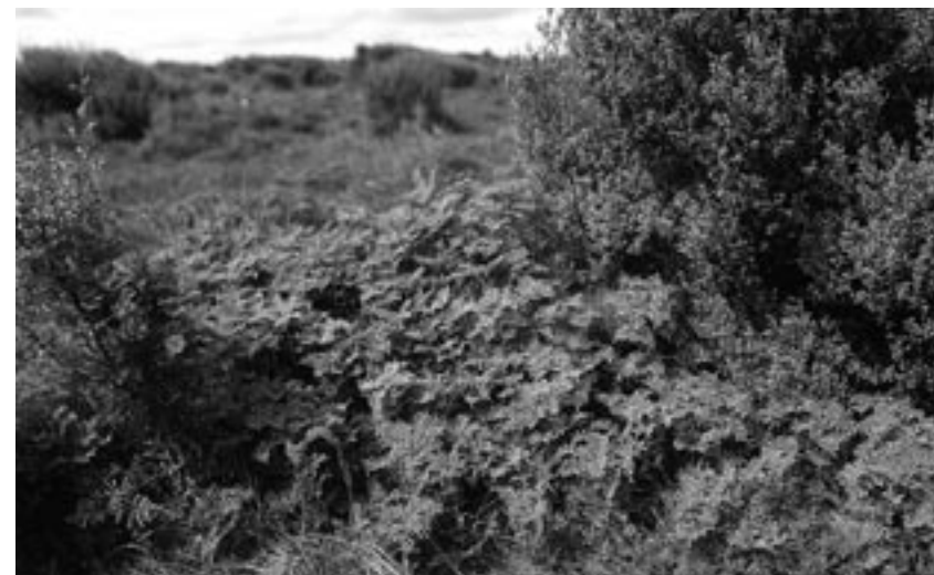
Fig. 62 Fernland. Taramoa, Southland; a lowland plain domed bog, some parts of which have sufficient fern cover to be regarded as fernland: tangle fern ( Gleichenia dicarpa ) fern bog; palustrine.