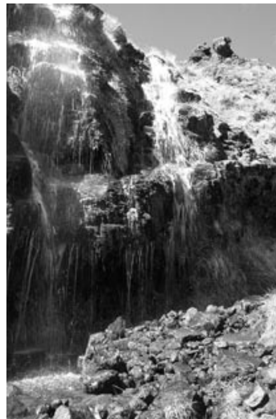
Fig. 46 Waterfalls produce gradations of habitats affected by water flow, splash, or spray; usually with herbfield or mossfield, and can mostly be classified as seepages, Tongariro National Park, Volcanic Plateau.

Man-made channels include canals, irrigation channels, open drains, and ditches.