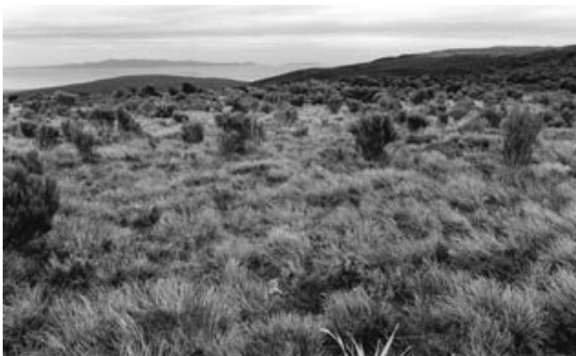
Fig. 60 Tussockland. Longwood Range, western Southland (and Stewart Island in distance); shallow peatland on a poorly drained range crest, with some Dracophyllum longifolium shrubland, but otherwise Chionochloa teretifolia tussock bog; palustrine.