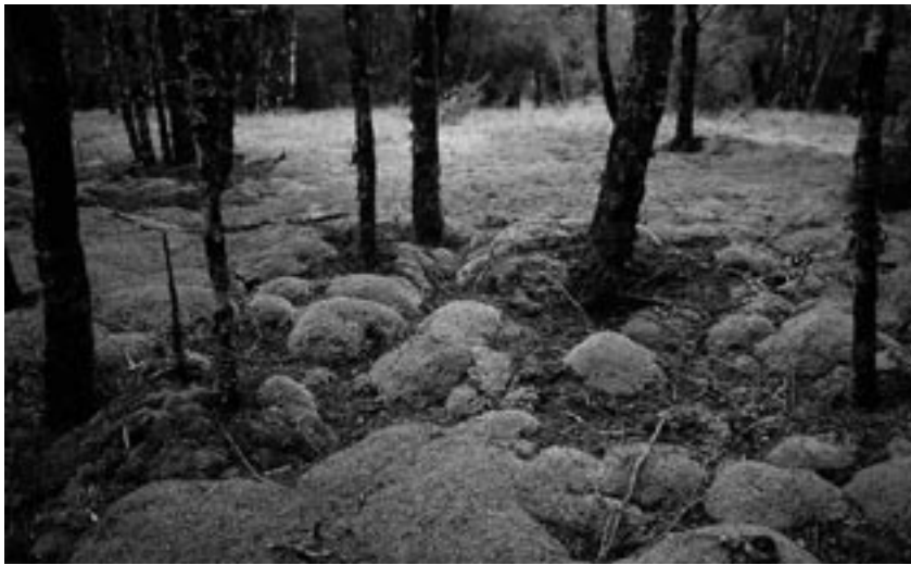
Fig. 53 Treeland. Maruia Valley, Buller; a gently sloping montane terrace having a high water table and constant flow of groundwater: mountain beech ( Nothofagus solandri var. cliffortioides ) / Sphagnum australe tree fen; palustrine.