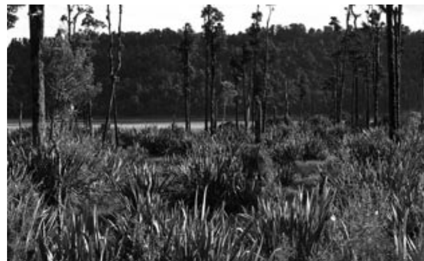
Fig. 52 Treeland. Lake Wahapo, Westland; lowland swamp close to a lake, where a high water table allows for the presence of only scattered and stunted trees: kahikatea / flax tree swamp; lacustrine. Note that in this example, tree cover is only marginally sufficient for this to be called treeland rather than flaxland.