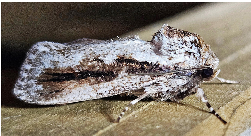
Figure 3. Titanomis sisyrota Frosted Phoenix, South Pegasus Hunters Hut, Stewart Island /Rakiura, At Risk – Uncommon.