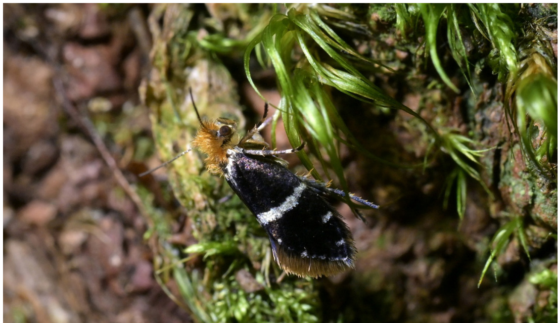
Figure 4. Sabatinca ianthina , Tararua Forest Park, Carterton District, Wellington Region, Threatened – Nationally Critical. Photo: Christopher Stephens, November 2025

The following Threatened – Nationally Critical species all require urgent survey to see if viable populations can still be located: Australothis volatilis , Ctenopseustis servana , Gymnobathra ambigua , Notoreas chrysopeda , Parienia mochlophorana , Sabatinca ianthina , Scoparia tuicana and Scythris niphozela . Fortunately, for most of these species, we have some idea of larval biology and host plants; the exceptions are the wetland species Parienia mochlophorana and Scoparia tuicana . In the case of the Threatened – Nationally Critical Hierodoris gerontion , Pyrausta comastis and Sporophyla oenospora , there are recent records from the last few years, but larval ecology and hosts have not been confidently determined, so follow-up research is required to try to elucidate conservation requirements.