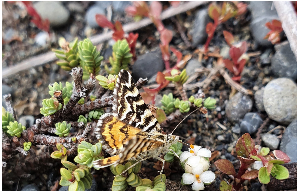
Figure 2. Notoreas perornata , Ōnoke Spit, Wairarapa, Wellington Region, At Risk – Declining.

Pyrgotis pyramidias s.s. moved from At Risk – Naturally Uncommon to At Risk – Declining. As pointed out by Patrick and Dugdale (2000), P. pyramidias s.l. seems to consist of two ecological entities, which may be taxonomically distinct. The silver beech-feeding form is not threatened, but the mingimingi shrub-feeding form ( P. pyramidias s.s.) from Invercargill and Rotorua is extremely restricted. Recent extensive intense shrubland fires (2022 and 2025) at Awarua peatland in Southland highlight the plight of species confined to these habitats, though no targeted survey work has been undertaken in recent years.