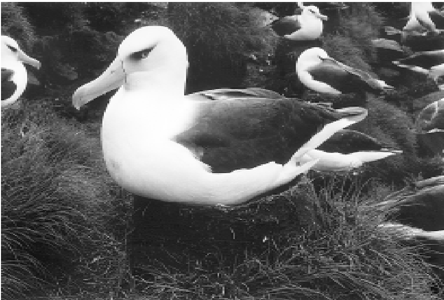
Figure 3. Campbell mollymawks occupying nests. (a) ( Above ) Sitting on a well-formed nest pillar and probably incubating an egg. (b) ( Right ) Occupying an empty nest. (c) ( Below ) Occupying a worn nest bowl.