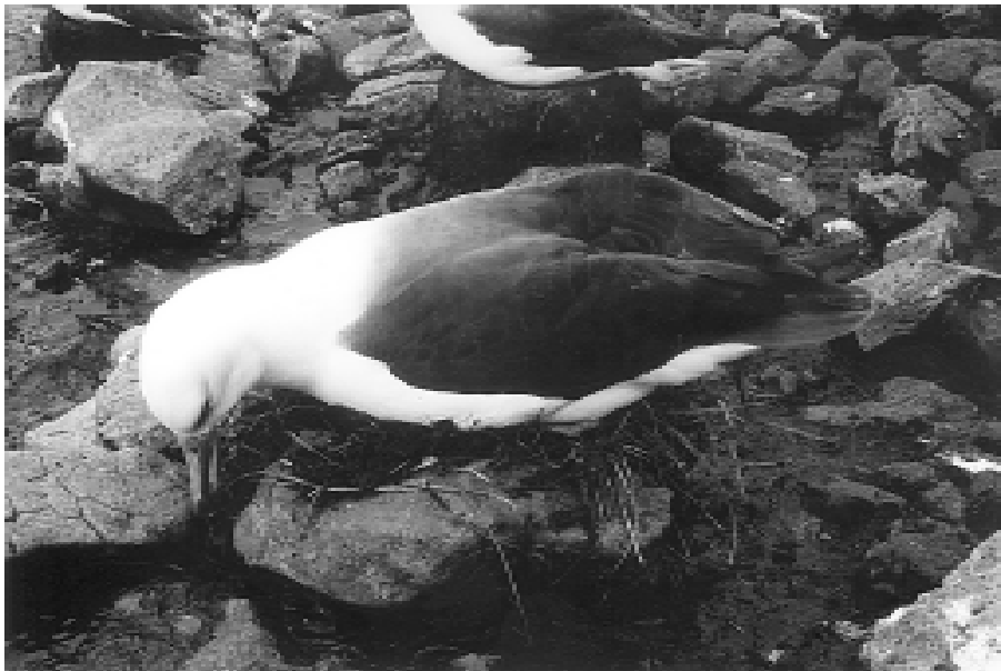
Figure 4. Rudimentary nests and non-breeding Campbell mollymawks. (a) ( Above ) Incubating an egg on a shallow nest bowl. (b) ( Left ) A juvenile building a rudimentary nest. This would still be classified as an occupied nest for counting purposes, since for any count other than a 'nest visit' it would appear similar to the type of nest shown in the top photograph. Non-breeders sometimes make play-nests or sit on nests that have been abandoned by breeders. (c) ( Below ) An 'extra' bird in the foreground is easily picked out from breeders at a distance by its posture (e.g. raised wing tips and tail).