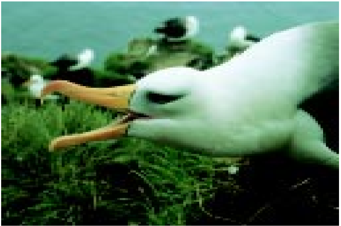
Campbell mollymawk arguing with its neighbour.