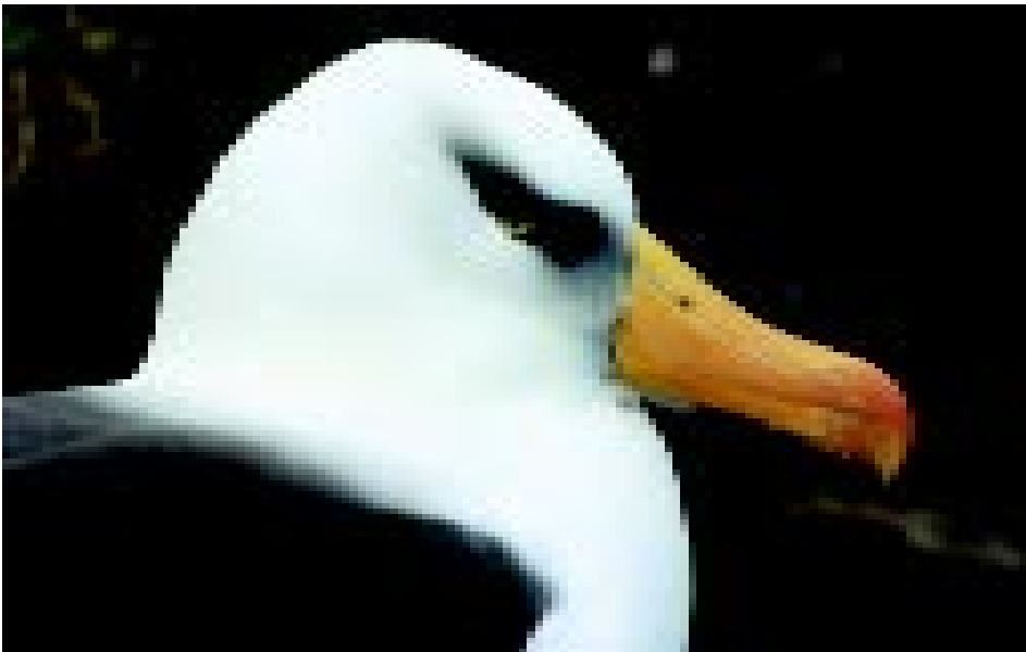
Figure 1. The three mollymawk species found on Campbell Island. (a) ( Above ) Campbell mollymawk—note the large dark 'eyebrow' and honey-coloured iris. (b) ( Right ) The black-browed mollymawk. (c) ( Below ) Grey-headed mollymawk.