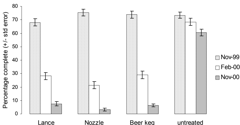
Figure 2. The effect of herbicide on mean live foliage encircling the pampas grass clumps by delivery system and over time—prior to herbicide application, and at 3 and 12 months after spraying.

At three months after herbicide application, both desiccation and percentage completeness of live foliage were affected by clump size, with larger clumps