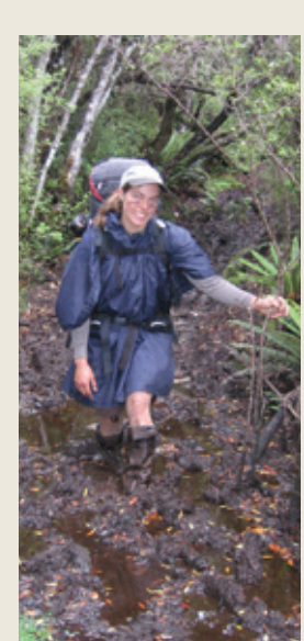
Mud can be thick and knee-