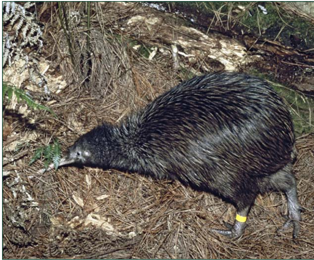
North Island brown kiwi.

Dogs are a major threat to kiwi. Kiwi have a strong scent, are flightless, and occupy burrows during the day, so they are especially vulnerable to attack by dogs. Their sternum (breastbone), which anchors the wing muscles used for flight in other birds, is very light and weak, and is easily crushed by a dog's jaws.