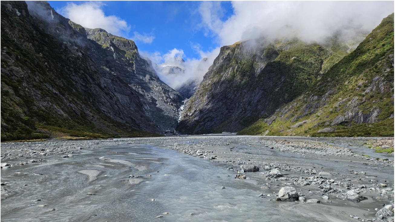
Challenging terrain encountered during ground-based tahr control operations in the Adams Wilderness Area in 2023.

Submitted to the New Zealand Conservation Authority in November 2024