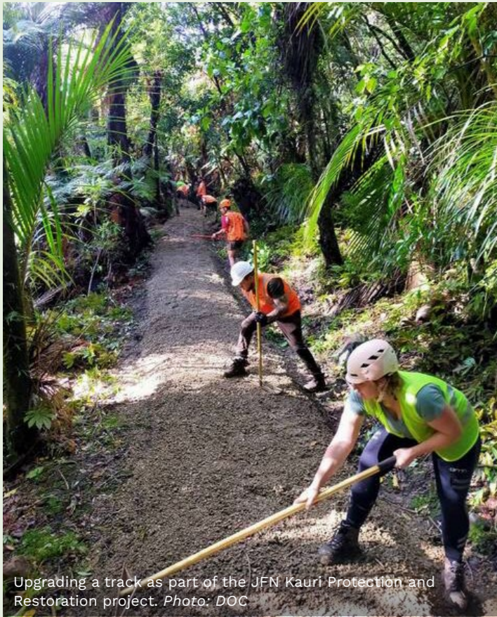
Upgrading a track as part of the JFN Kauri Protection and Restoration project.