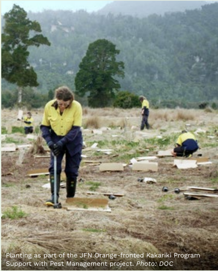
Planting as part of the JFN Orange-fronted Kakariki Program Support with Pest Management project.