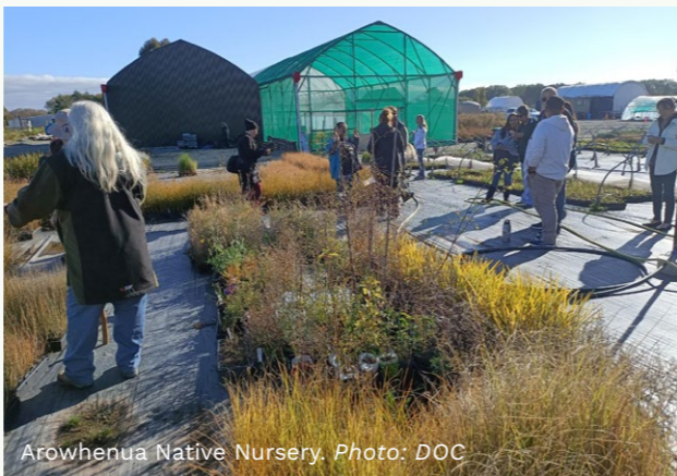
Arowhenua Native Nursery.

Gisborne District Council and Maraetaha Incorporated, supported by te iwi o Ngāi Tāmanuhiri, are working together to protect the drinking water supply and restore indigenous ecosystems in Tairāwhiti. Their mahi is helping to reduce erosion and sediment, improve water quality, and restore the mauri of lowland forest habitat for taonga species. The project has created enduring employment and education opportunities, encouraging career pathways in the sector.