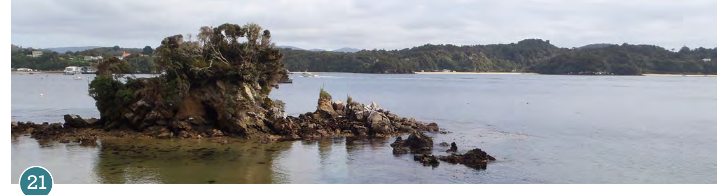
Halfmoon Bay.