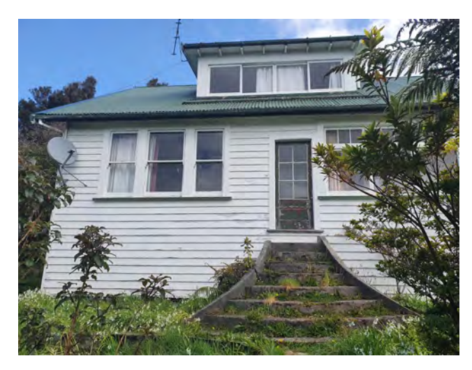
Raroa House.

There is no charge for this activity. However, volunteers will need to make their own travel arrangements to and from Stewart Island/Rakiura. Food, accommodation and transport will be provided by DOC on the island.