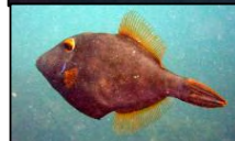
LEATHER JACKET or KŌKIRIKIRI Parika scaber