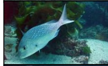
SNAPPER or TAMURE Pagrus auratus