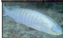
PARORE Girella tricuspidate