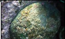
PAUA / ABALONE Haliotis iris