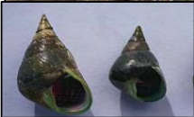
SMALL OPAL TOP SHELL Cantharidus opalus