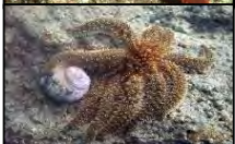
ELEVEN ARMED STARFISH Coscinasterias calamaria