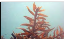
FLAP JACK Carpophyllum maschalocarpum