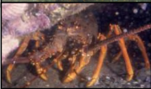
RED ROCK LOBSTER or KOURA Jasus edwardsii