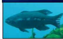
BUTTERFISH – MARARI/KOEAEA Odax pullus