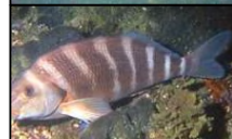
RED MOKI or NANUA Cheilodactylus spectabilis