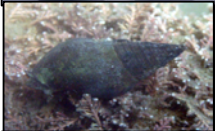
LINED WHELK Buccinulum species