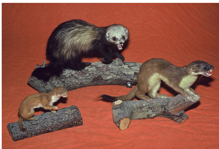
Weasel (left front), ferret (back), stoat (right front).

Stoats and other mustelids will eat native and endemic birds, their chicks and eggs, invertebrates, rodents, lizards, hedgehogs and fish. They are carnivores and only eat other animals. Stoats can climb trees and swim a few kilometres, and they hunt day and night.