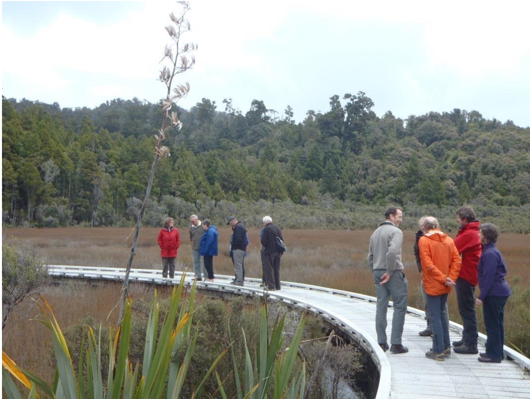
Walking over the new board walk in Okarito