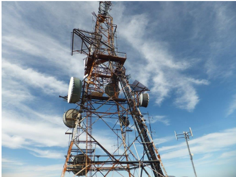
The Mt Rochfort tower