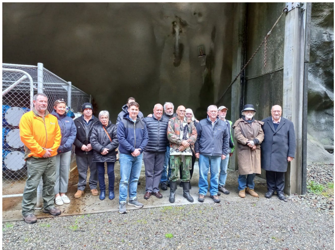
Board Members, DOC Staff and Pike River Families gather at the Pike River Mine Portal.