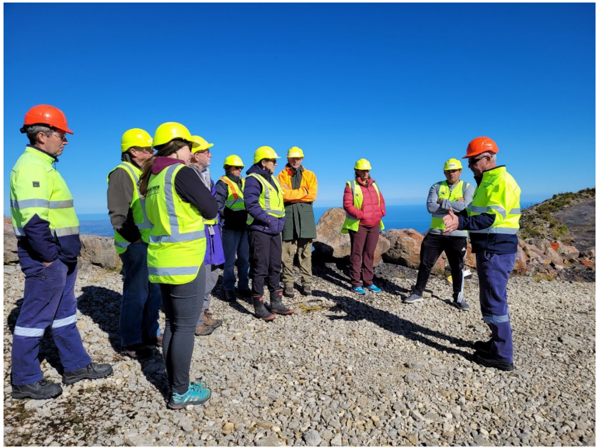
Board Members and DOC Staff learning about Stockton Mine.