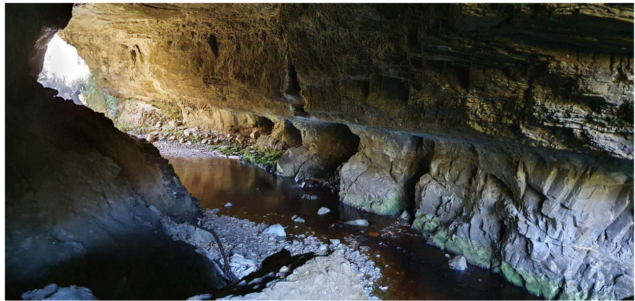
Ōpārara Arch.

There are two national parks within the jurisdiction of the Board's region: Paparoa National Park and Westland National Park. The Board also advocates for cross boundary issues with Kahurangi National Park (which is the responsibility of the Nelson Marlborough Conservation Board), Arthur's Pass National Park (Canterbury Aoraki Conservation Board) and Mt Aspiring National Park (Otago Conservation Board).