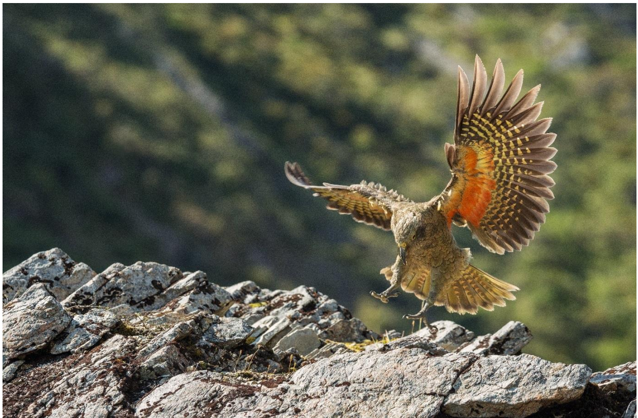
Kea