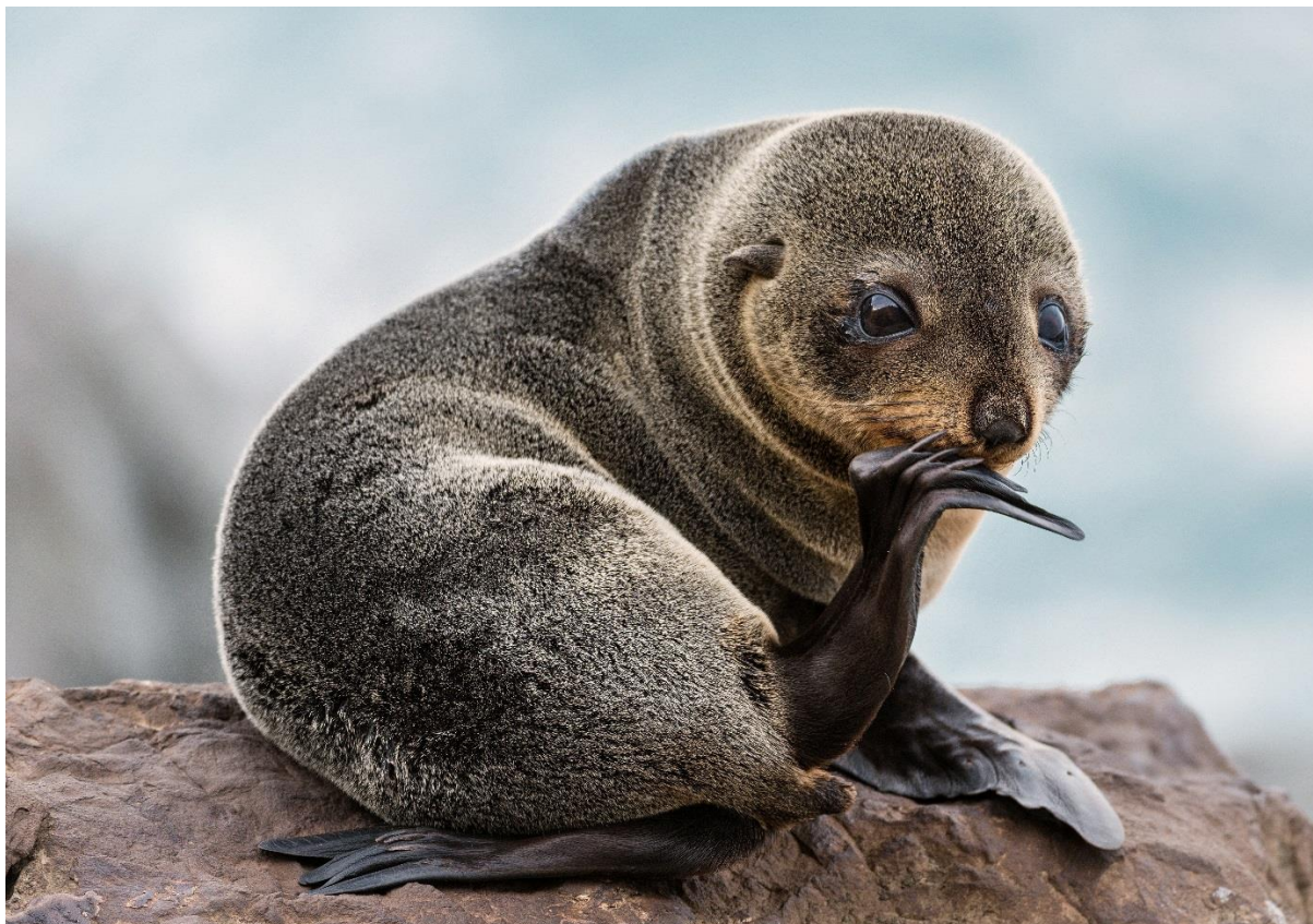
Kekeno pup

Two members of the Board are nominated by Ngāi Tahu as required under the Ngāi Tahu Settlement Act 1998. The Board worked closely with Te Runanga o Makaawhio for the purpose of the Tai Poutini Westland Park Plan Review.