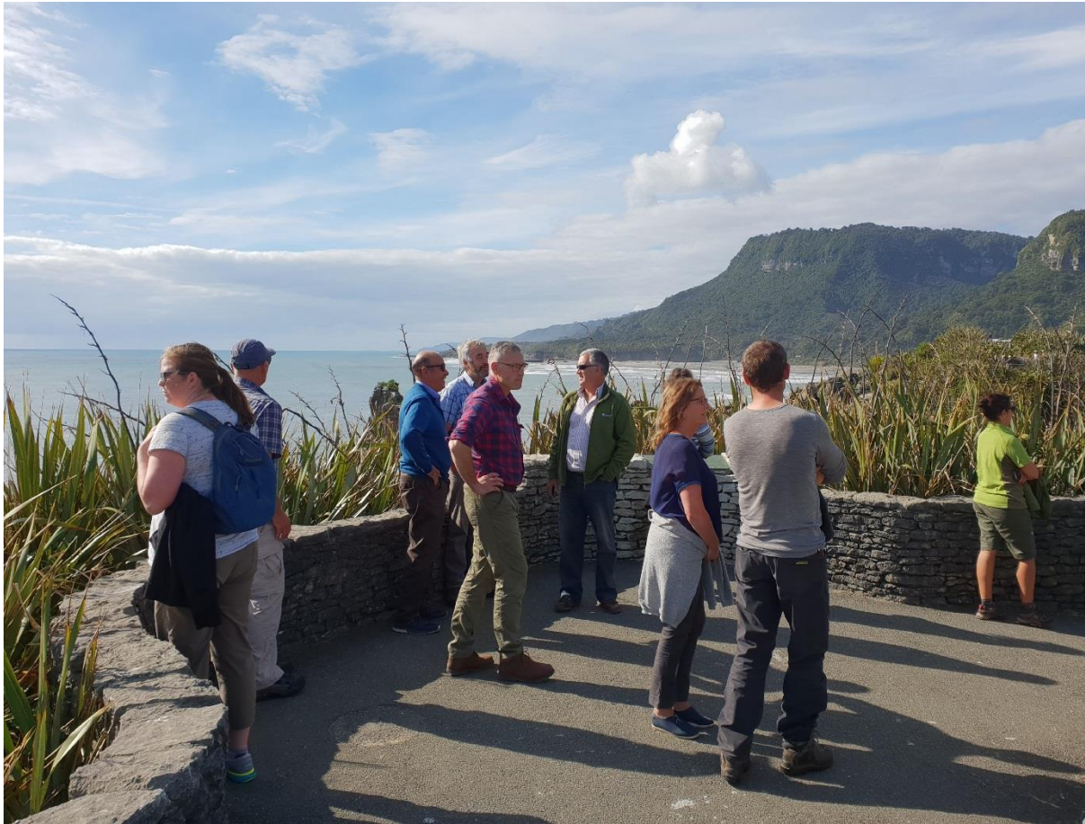
NZCA members, Board members and DOC Look out point Punakaiki.