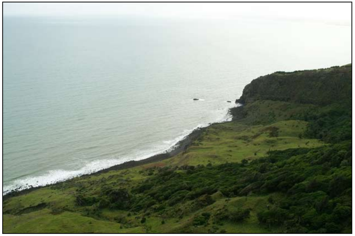
View from Te Toto Gorge viewing platform.