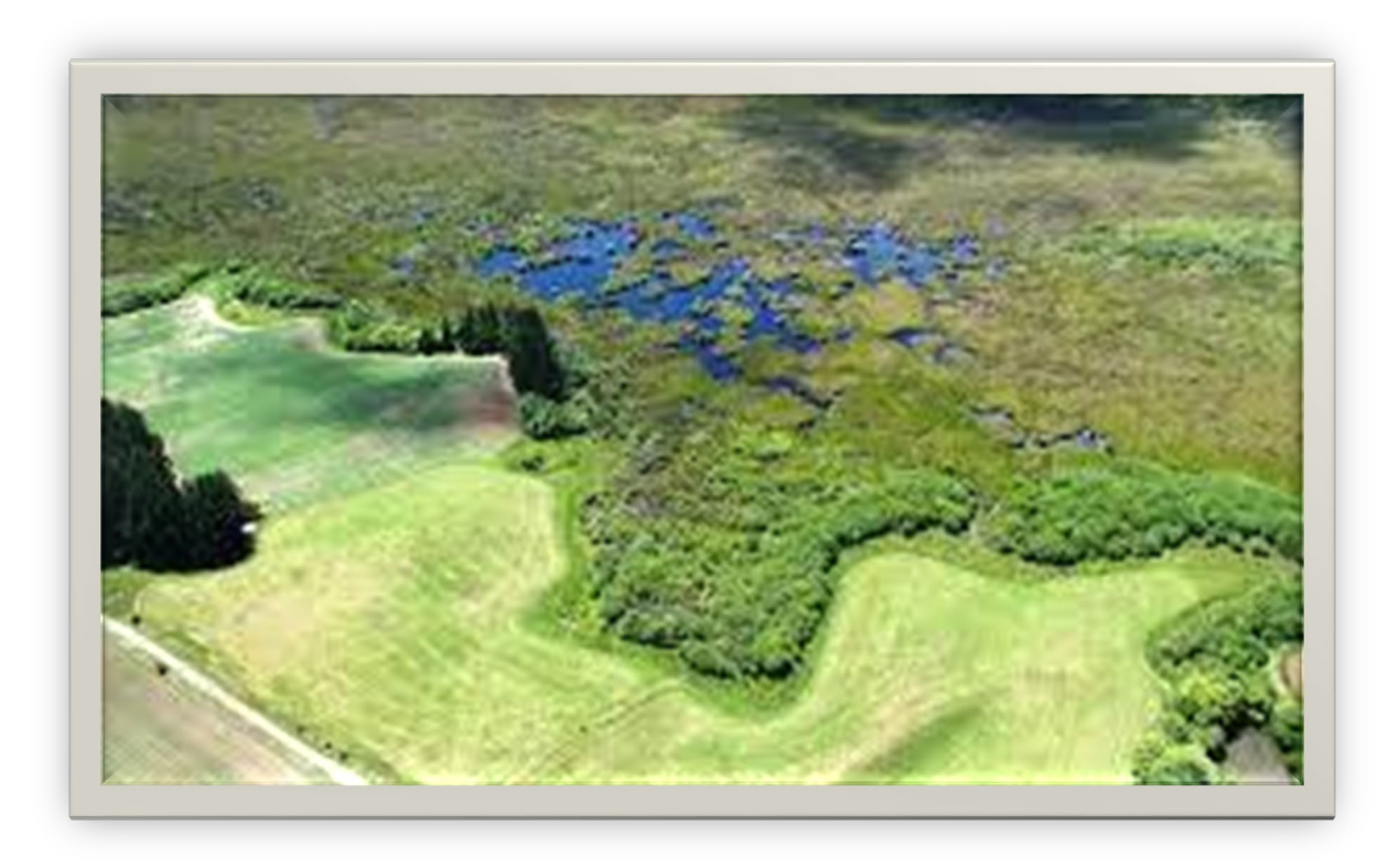
Whangamarino Weir