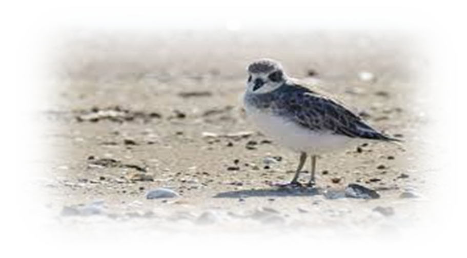
$\operatorname{NZ} Dotterel