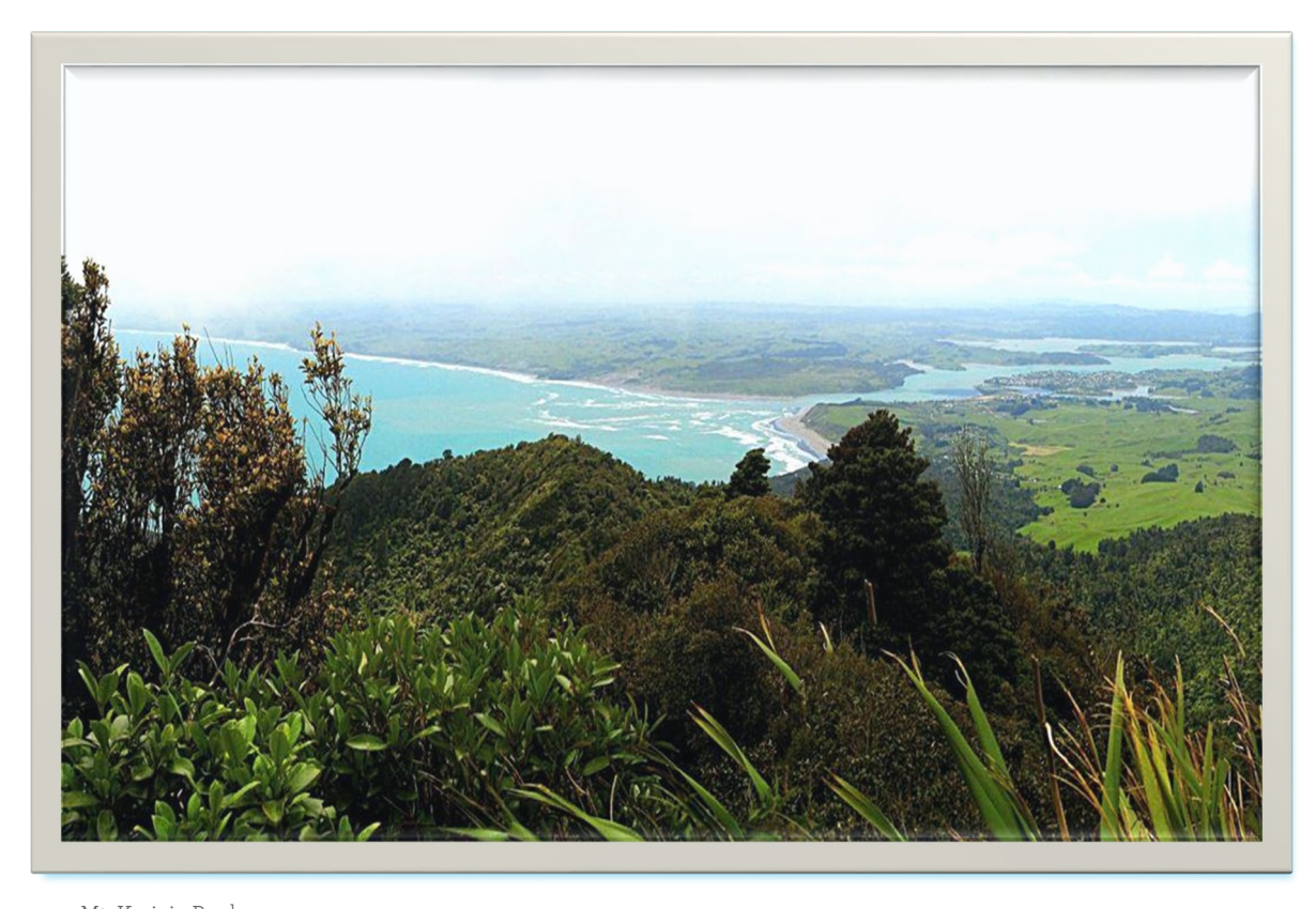
Mt. Karioi - Raglan