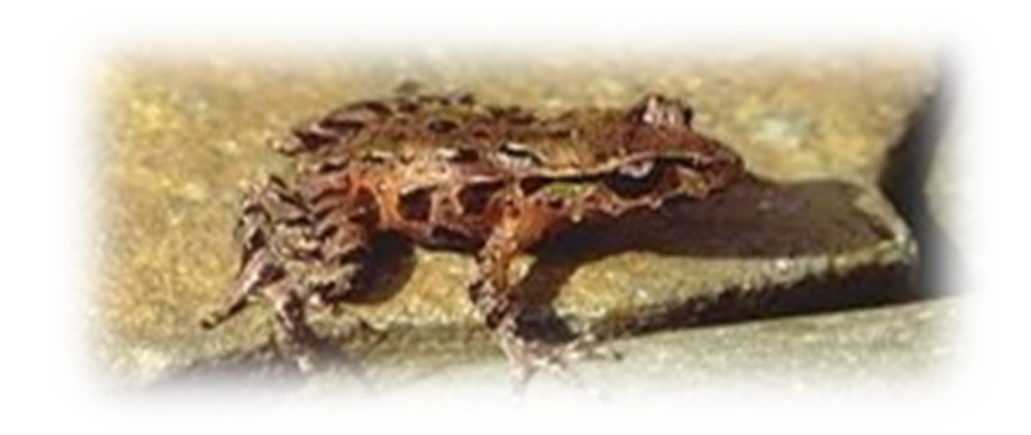
Archey's Frog

(Kokako, Mahoenui Giant Weta, Whitebait, Maui's Dolphin, Kiwi and particularly the Coromandel Brown Kiwi and Archey's and Hochstetter's Frog)