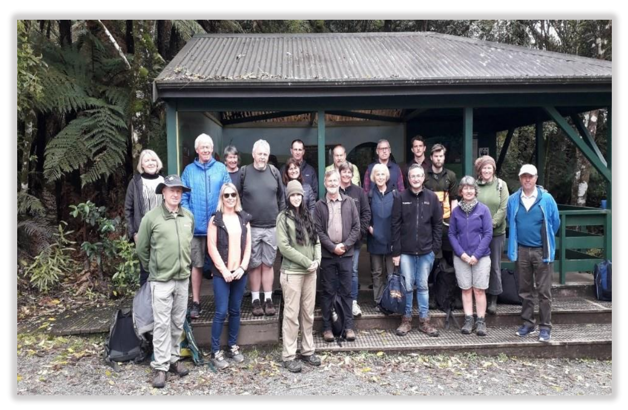
NZCA / DOC - Pirongia Forest Park — 7 October 2019

The New Zealand Conservation Authority (NZCA) held its October meeting in Hamilton on the 8<sup>th</sup> October, with a field trip, hosted by Waikato District DOC staff, to Pirongia Forest Park, on the 7th of October. The Conservation Board joined them on this excursion.