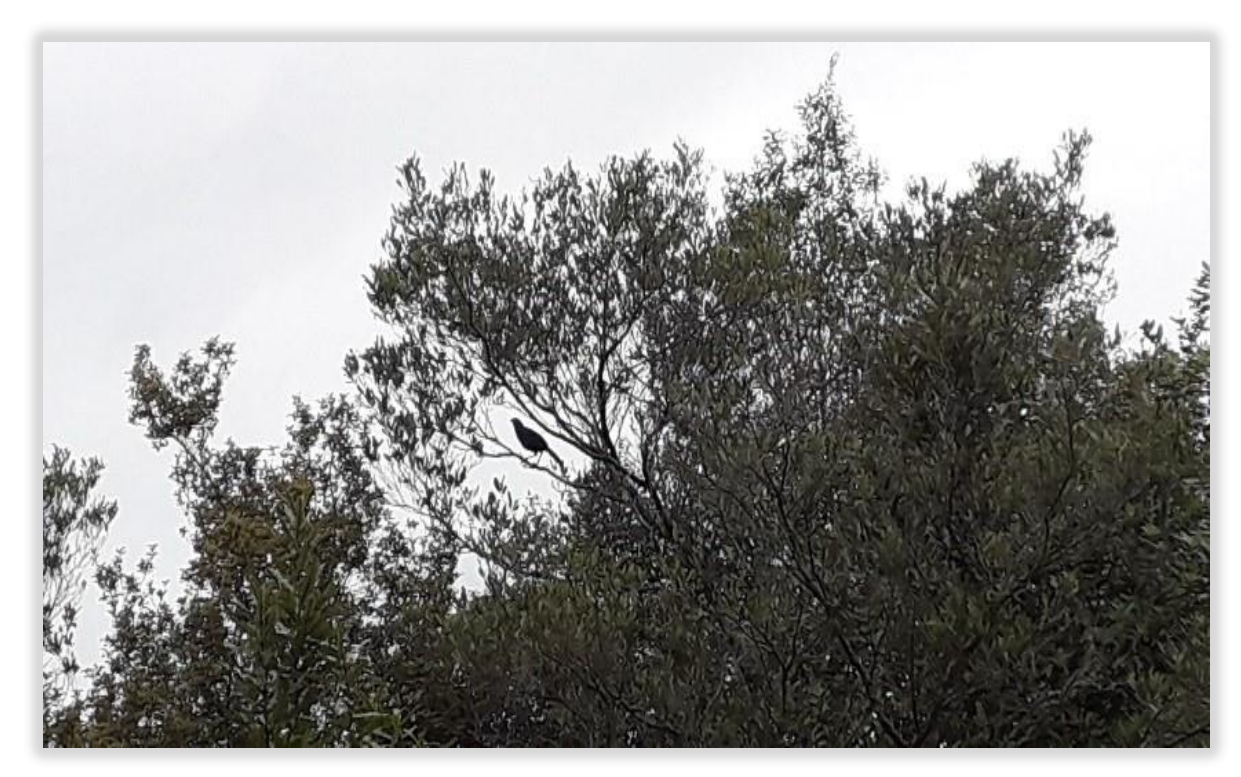
Kokako - Pirongia Forest – 7 October 2019

Following presentations and prior to walking the Mangakaara Bush Loop Track members were very fortunate to see two kokako.