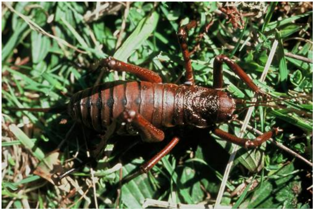
Mahoenui giant weta. Previously considered extinct, rediscovered in an area of King Country gorse and features in the Waikato CMS