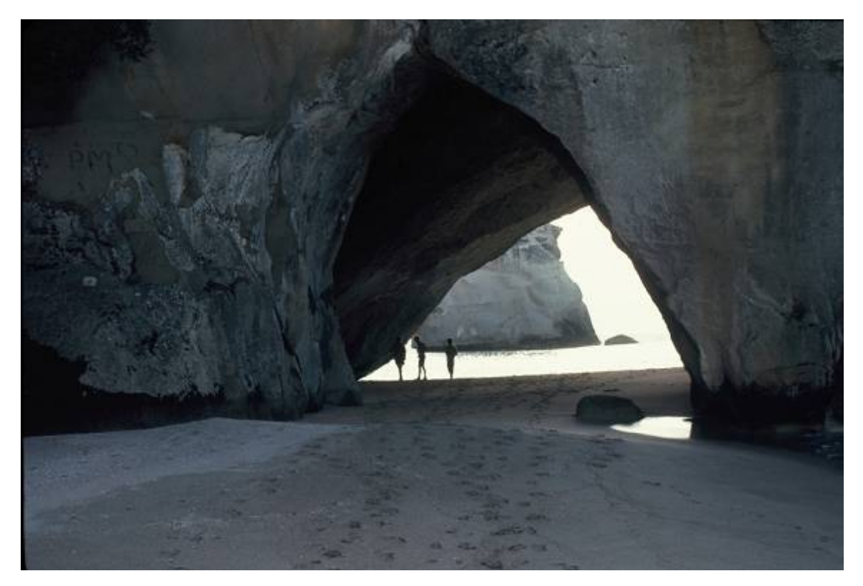
Cathedral Cove, Coromandel

to Whitianga and an upcoming multi agency meeting with the Waikawau Bay Community to discuss proposed works in the area