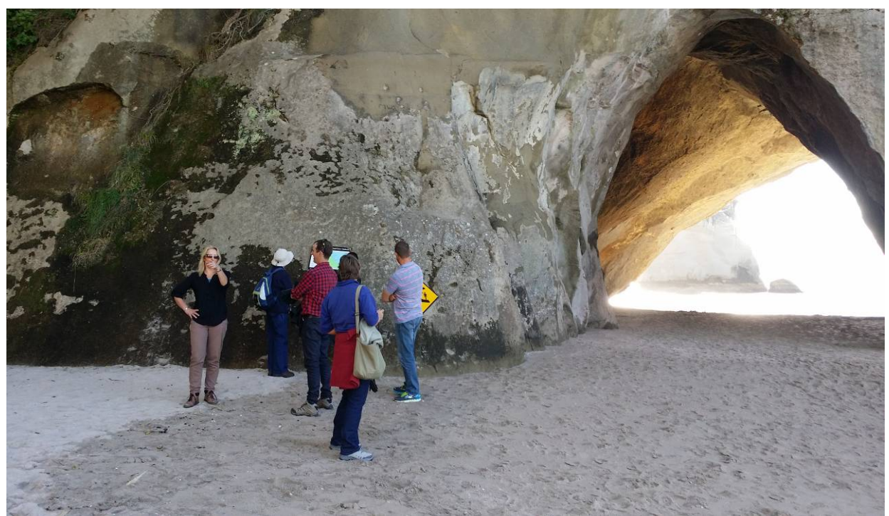
Checking out Cathedral Cove and the interpretation and warning signs mentioned as visual pollution by Ngati Hei

The Board then visited Cathedral Cove which is the smallest "Place" in any CMS which reflects the magnitude of integrated management required in this small but significant cultural site and tourist destination. The visit was to provide visibility of this Place and possible CMS direction to the Board i.e one of the CMS milestones which may be deferred as the integrated plan is to be reviewed as part of the Hauraki Treaty settlement.