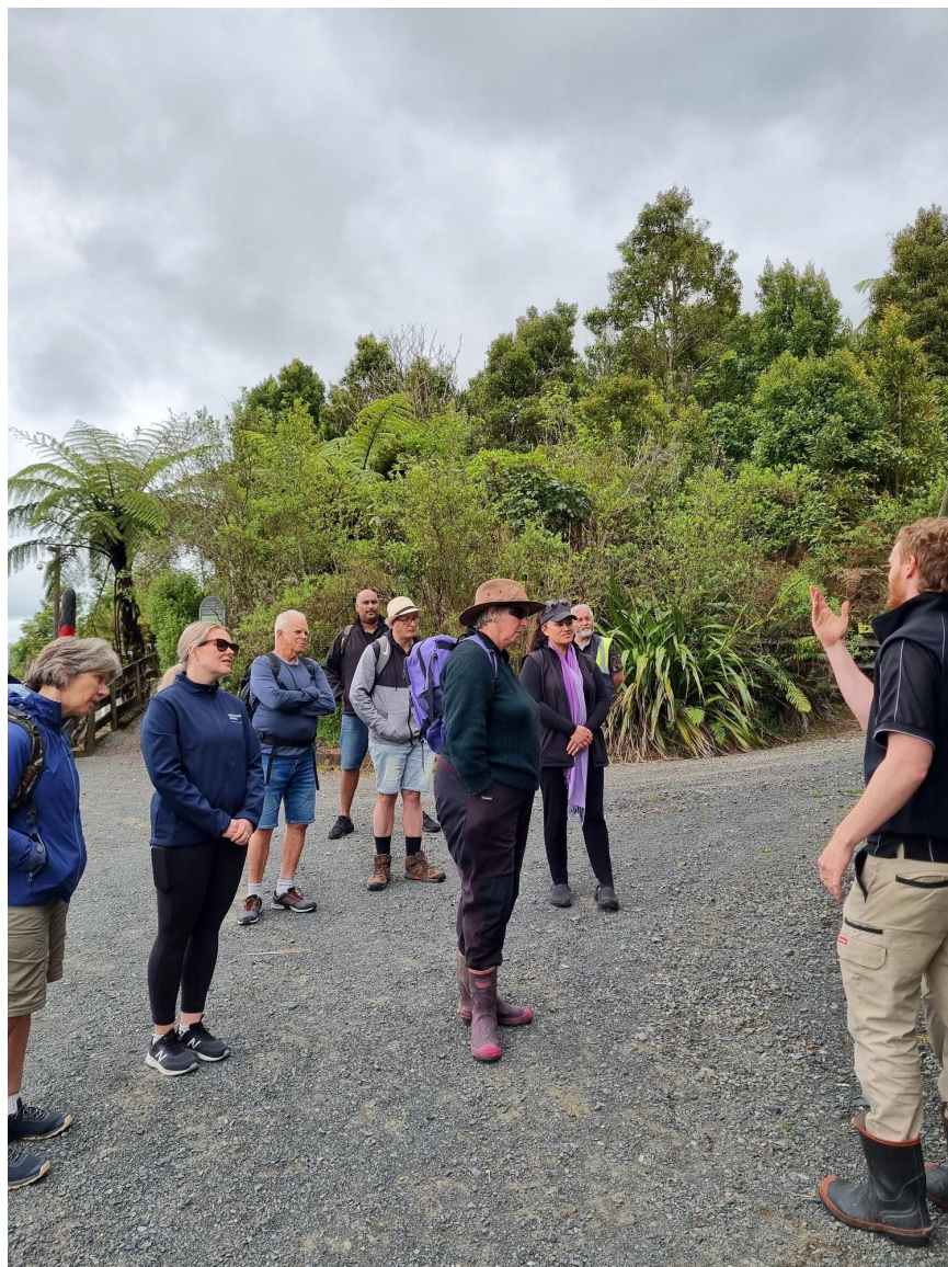
The Board listening to the Sanctuary's work

The Board visited Maungatautari Sanctuary, greeted by the Sanctaury's staff and management. The Board spent time to understand the organisation's work and toured the regenerating forest amongst the wildlife with a biodiversity ranger.