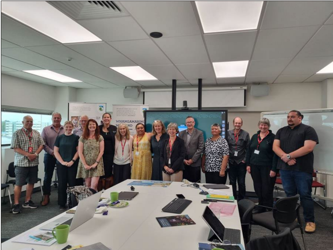
Joint hui: Auckland and Waikato Conservation Board, 15 March 2024

Presented to the New Zealand Conservation Authority pursuant to Section 6(O) of the Conservation Act 1987