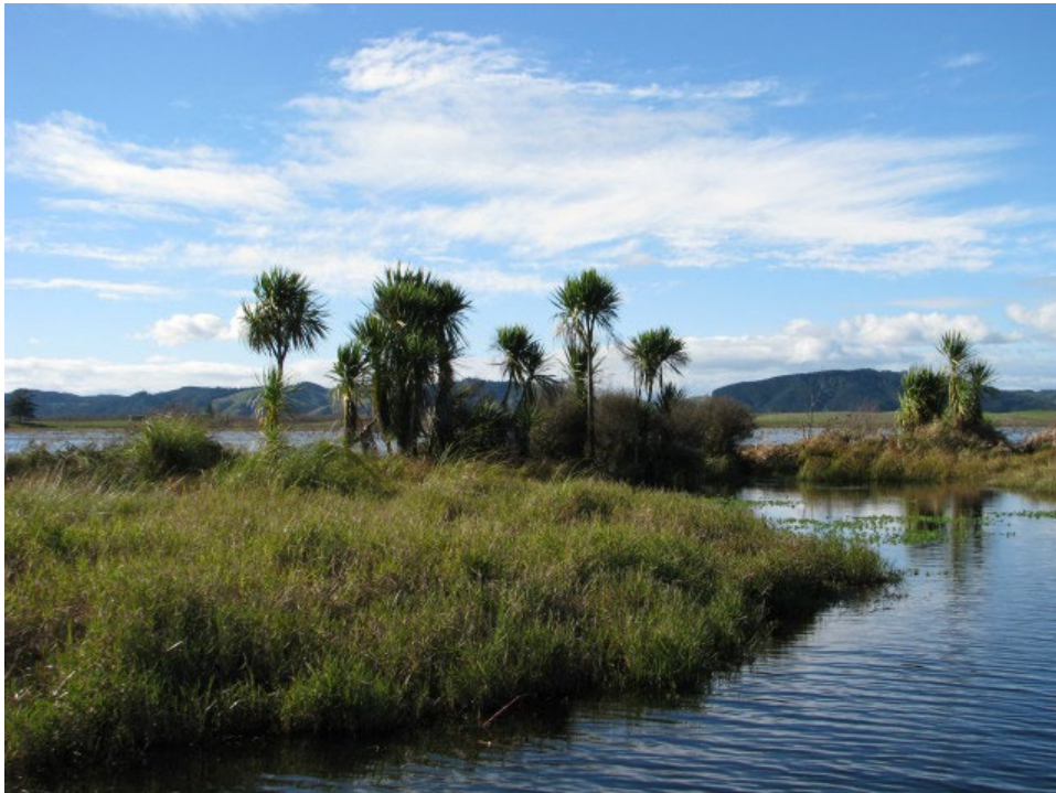
DOC image - Whangamarino