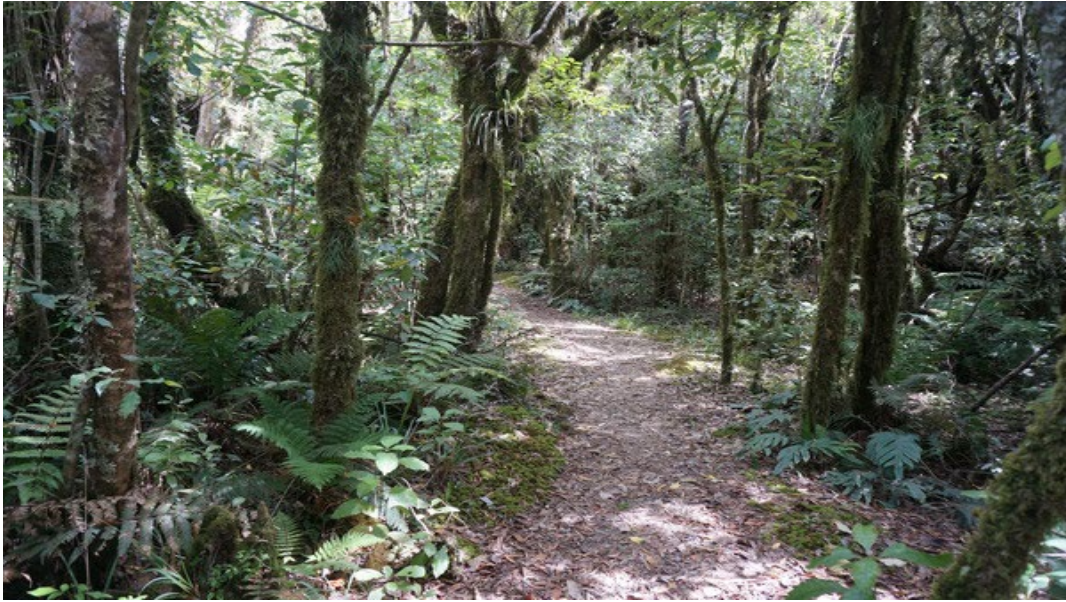
DOC image – Pureora Forest park