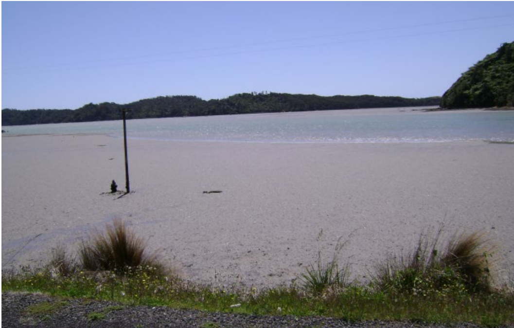
DOC image - Kawhia