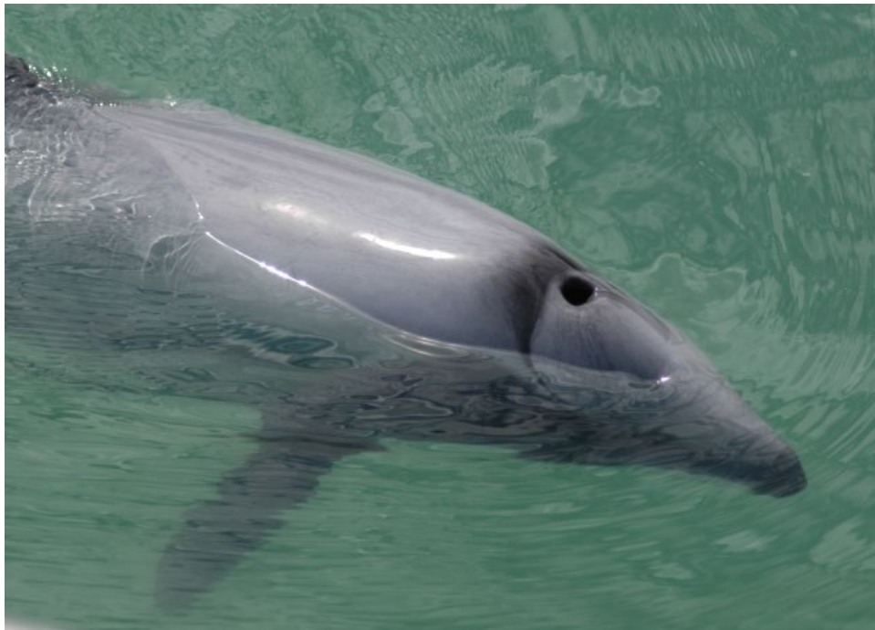
Māui Dolphin