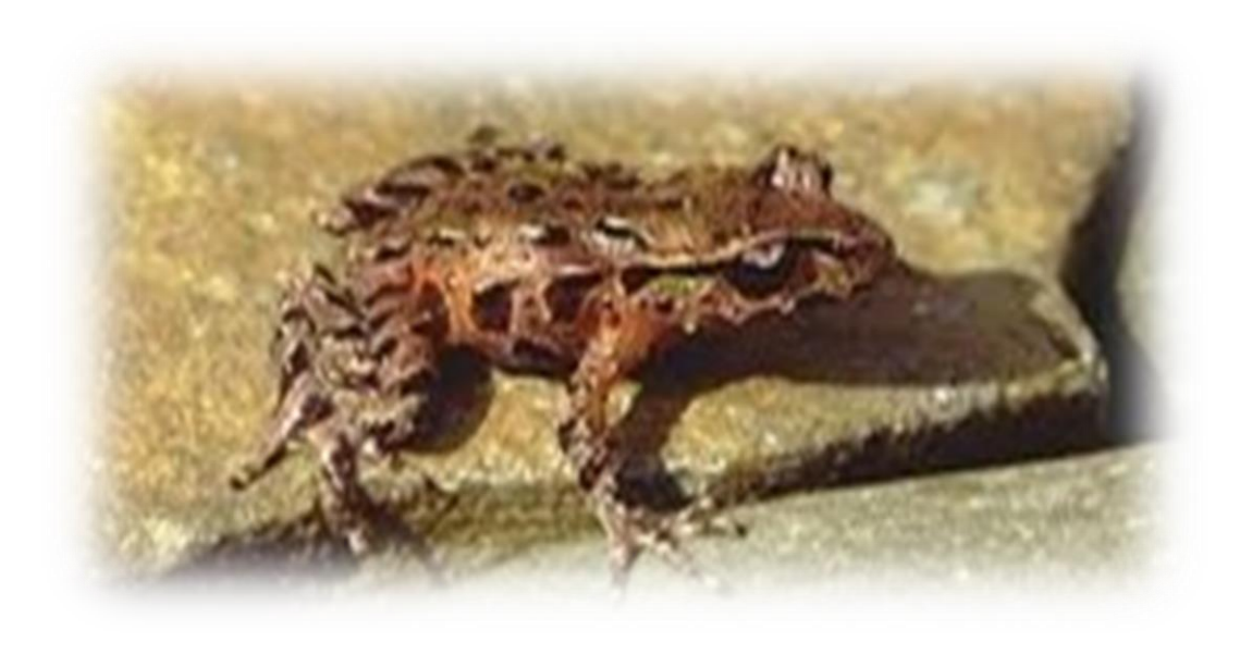
Archey's Frog

• Rare and endangered species /ecosystems (Kōkakā, Mahoenui Giant Wētā, Whitebait, Māui Dolphin, Kiwi and particularly the Coromandel Brown Kiwi and Archey's and Hochstetter's Frog)