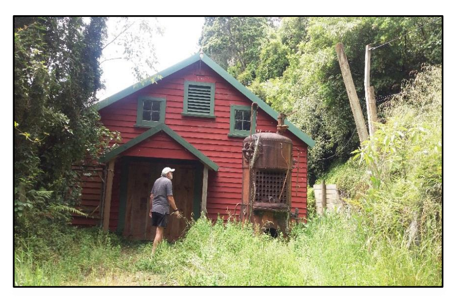
Whitebait Cannery – Waikato River – November 2017

A visit to the old whitebait cannery on the Waikato River bank provided a pleasant bonus as well as helping draw the contrast between present and past volumes of fish being caught. The cannery operated from c1910 to 1959 and the building is being restored by whitebait enthusiast, Ralph Dwen. The building is in reasonable condition and has some remnants from the canning process on display.