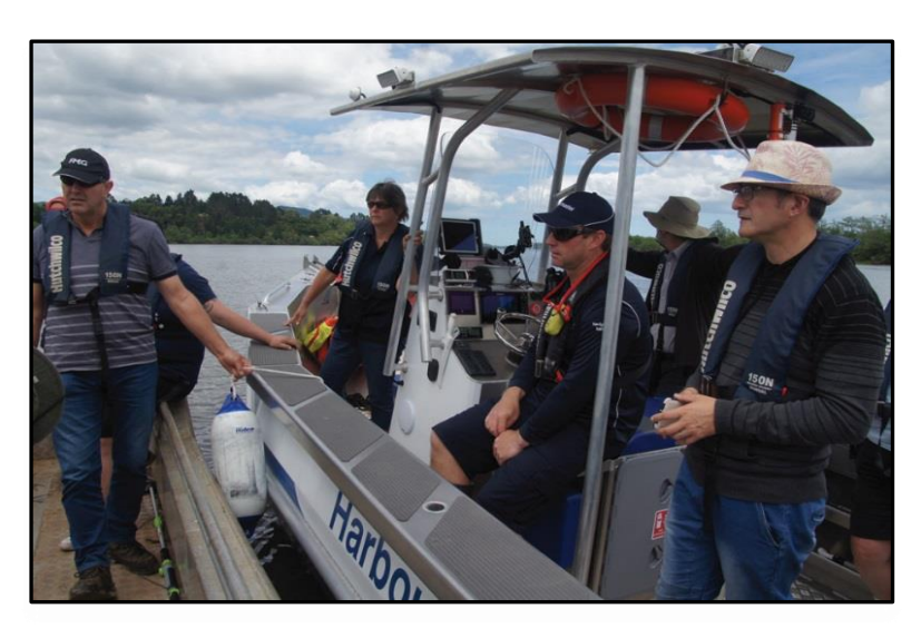
Waikato Conservation Board Members - Waikato River

The Board has taken a keen interest in whitebait issues and the fishery for some years and enjoyed this opportunity to get out on the water with DOC staff and see first-hand the river environment.