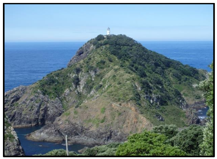
Repanga Island - March 2018

When everyone was assembled a whakatau took place with speakers from the Waikato Conservation Board, DOC and Ngati Hei and once this concluded there was an exchange of traditional greetings. Also present were representatives from Ngati Huarere ki Whangapoua. Karakia were then recited to bless those in attendance and send the tuatara on their journey.