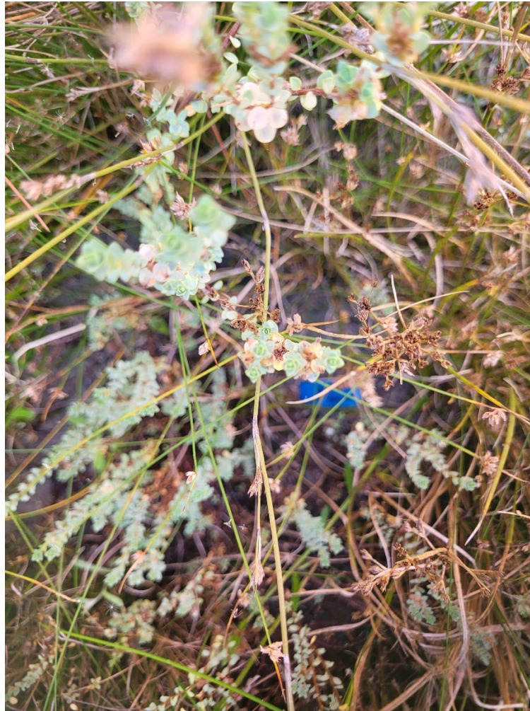
Pimelea Actea - Himatangi Beach

This report is presented to the New Zealand Conservation Authority as required by the Conservation Act 1987 and distributed to interested parties. Members of the public are welcome to attend conservation board meetings. If you would like more information on the Wellington Conservation Board please see the website www.conservationboards.org.nz or contact the board support officer, at the Department of Conservation in Palmerston North (027) 417 5246 e-mail cljacobs@doc.govt.nz .