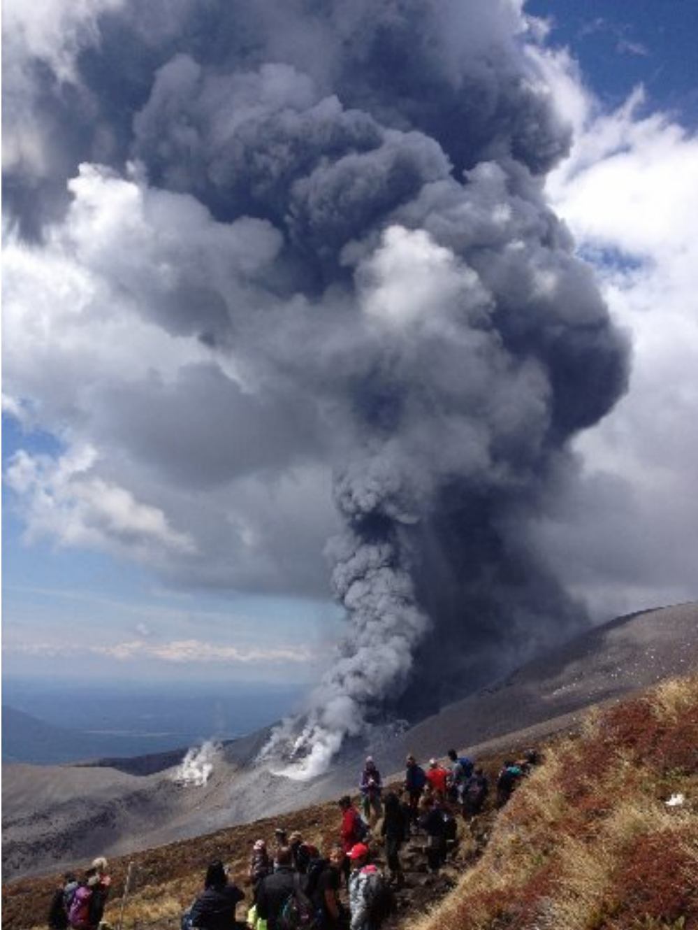
Cover Photo: Te Maari Eruption Nov 2012