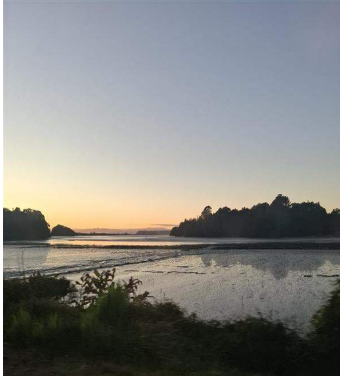
Ohiwa Oyster Farm