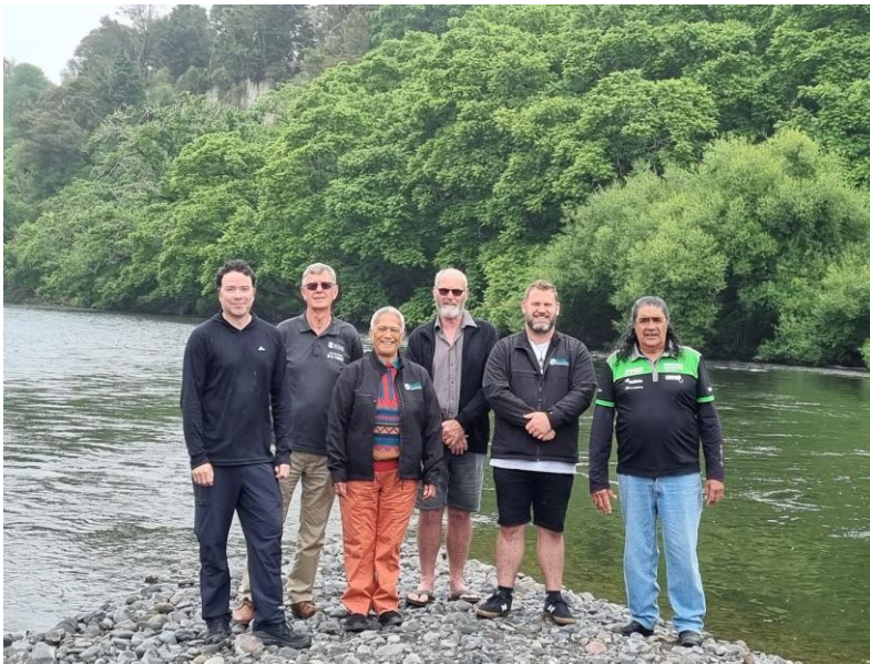
Taranaki Whanganui Conservation Board field trip to Taumarunui – Cherry Grove – November 2024

Presented to the New Zealand Conservation Authority pursuant to Section 6 (O) of the Conservation Act 1987