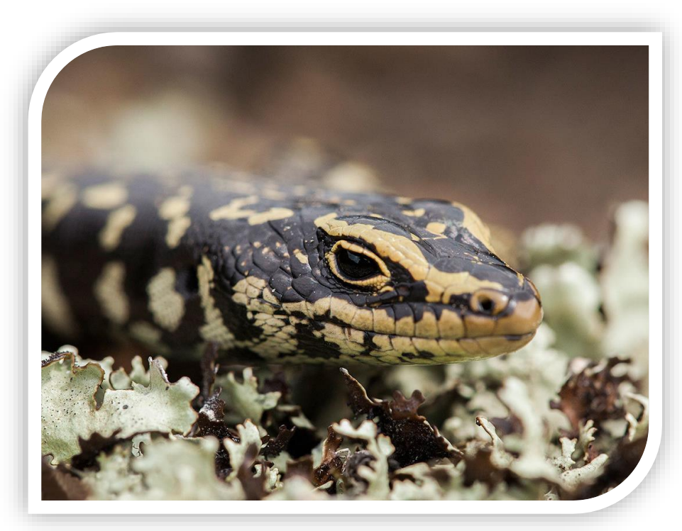
Otago\ Skink/Mokomoko\ -\ Sabine\ Bernert,\ DOC