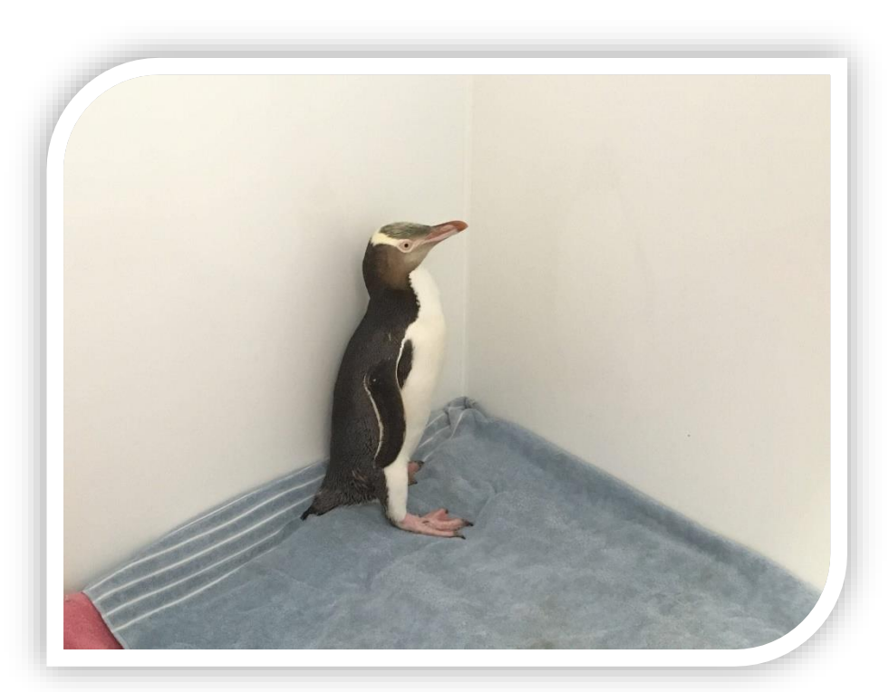
Hoiho\ patient.\ Wildlife\ Hospital\ \bar{O} tepoti,\ Dunedin-photo\ credit