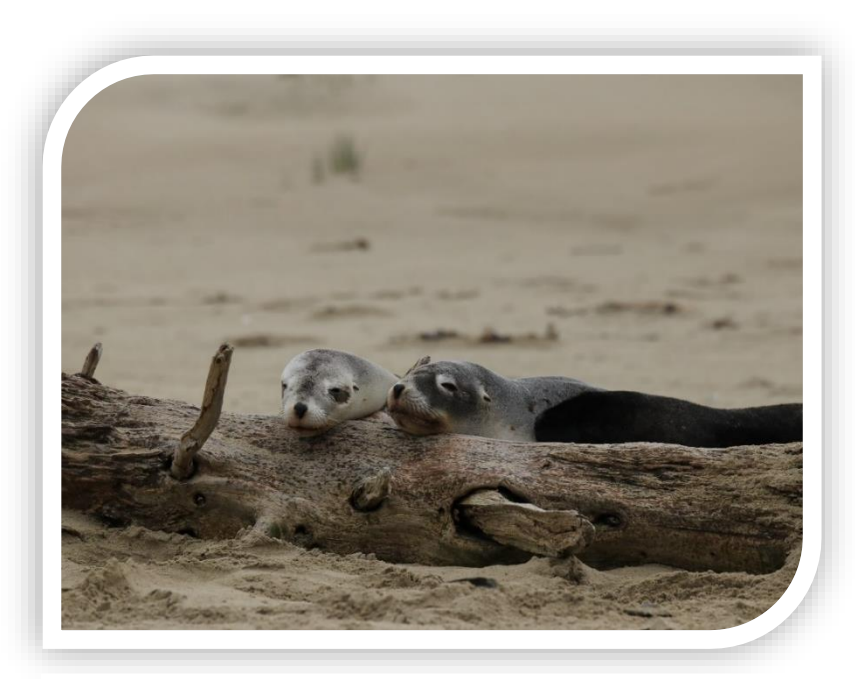
Seals at Catlins

The Conservation Act requires Conservation Boards to provide the New Zealand Conservation Authority with an annual report as soon as practical after 30 June each year. In recognition of this requirement the Otago Conservation Board submits this twentieth annual report.