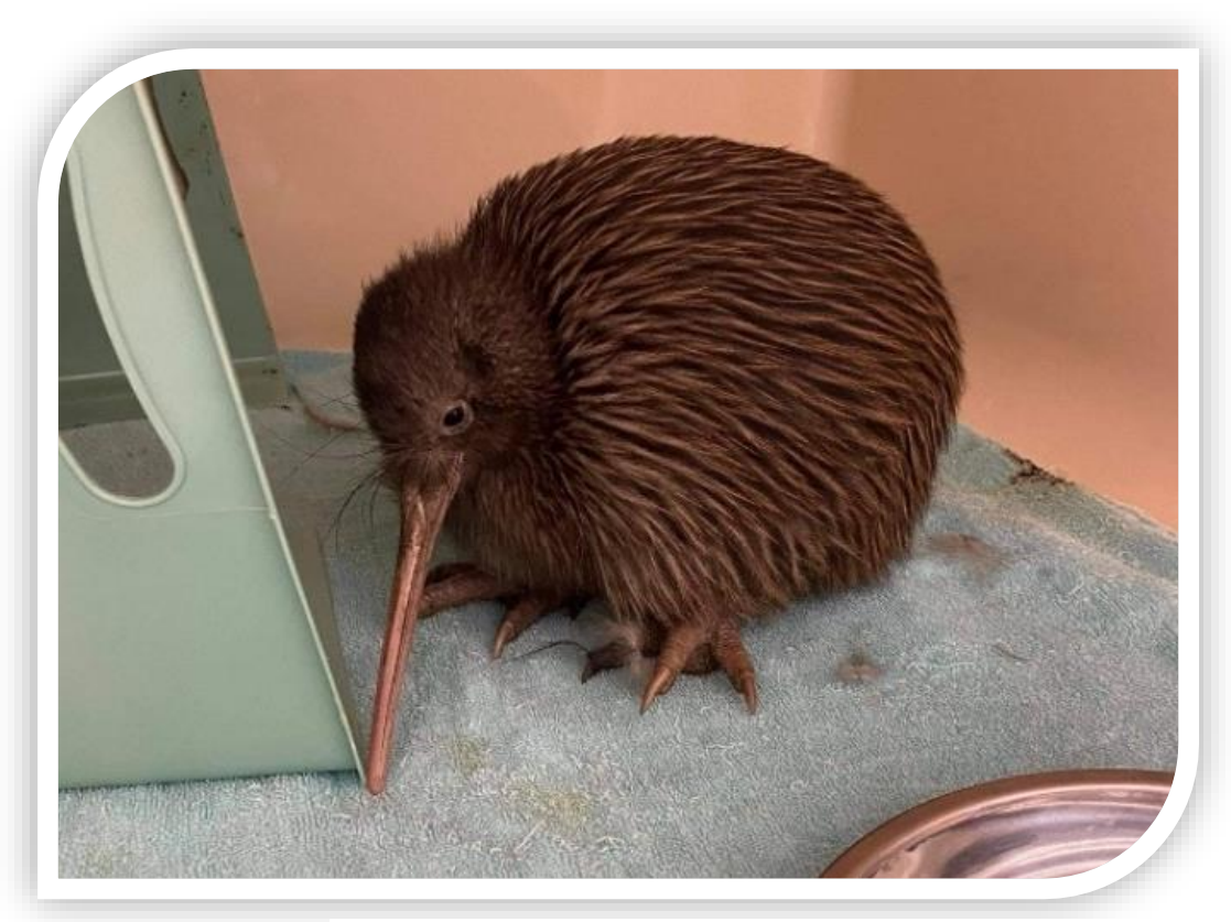
Kiwi patient. Wildlife Animal Hospital Dunedin - photo credit