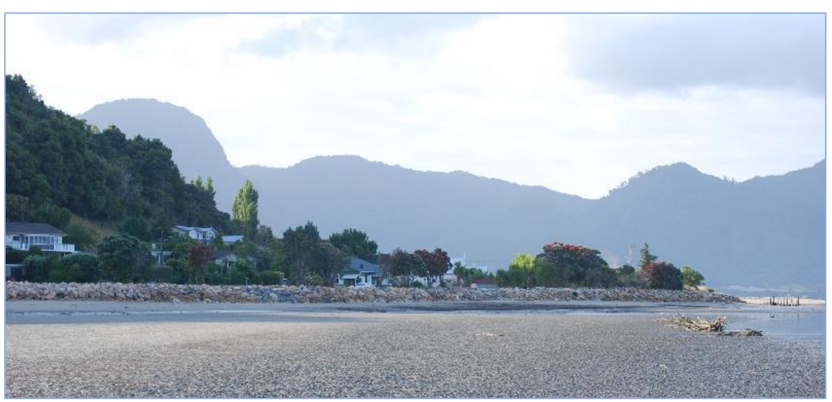
Whakamarama Range, Kahurangi National Park from Collingwood, Golden Bay