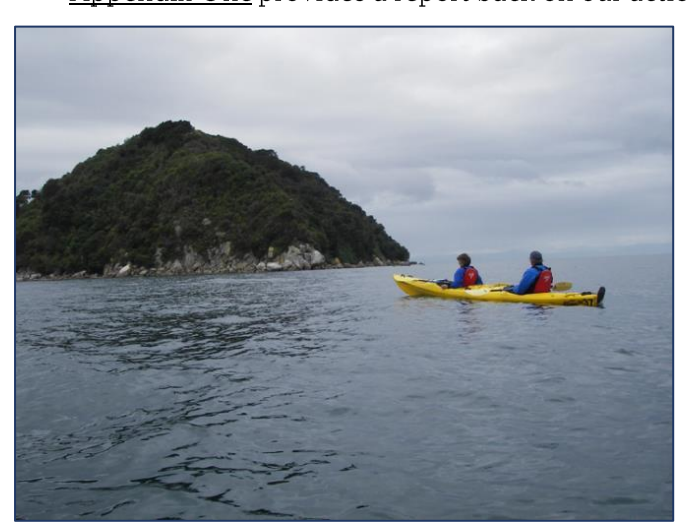
Tonga Island, Abel Tasman National Park

Appendix One provides a report back on our actions to June 2019.