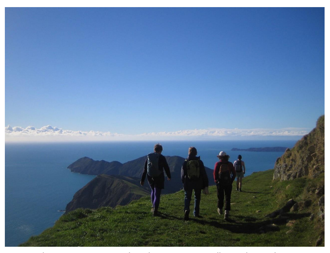
Cape Lambert Scenic Reserve and Cook Strait, Outer Marlborough Sounds

Conservation Boards are independent advisory bodies, established by statute. They represent the community and offer interaction between communities and the Department of Conservation (the Department), within their area of jurisdiction.