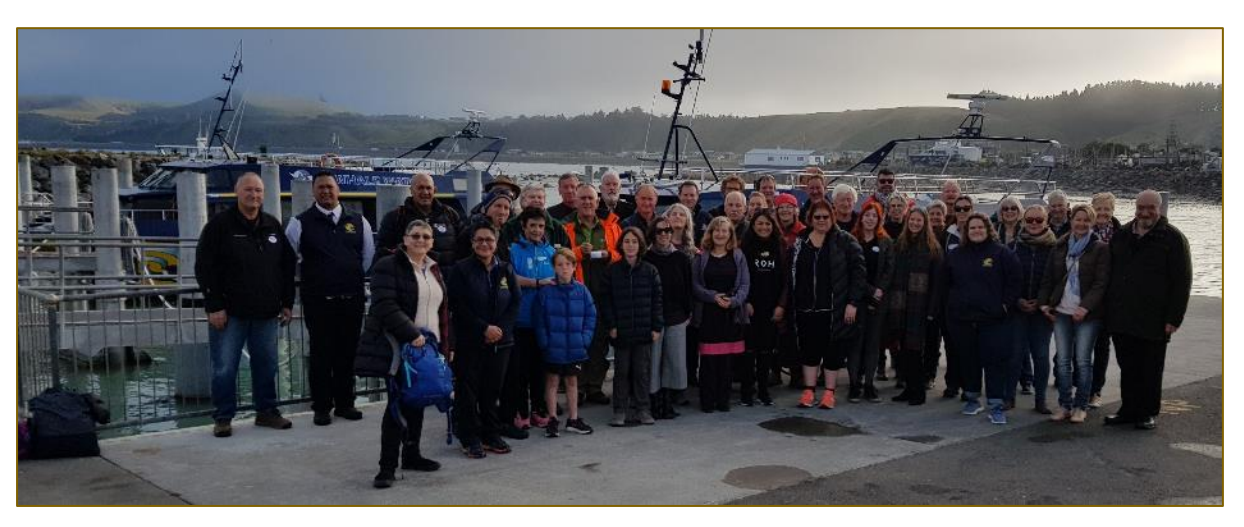
Board members and guests, Whale Watch trip, Kaikōura May 2019