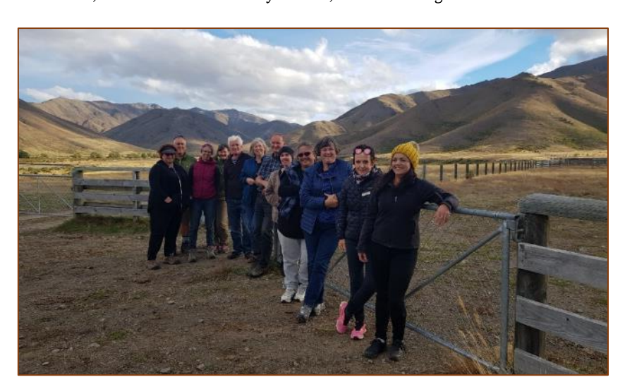
Board members and staff at Red Gate, Molesworth, April 2019.

On 24 May 2019 the weather proved to be much more benign and a large group of 48 in total, comprising Board members, whānau and guests from other groups enjoyed a morning on a Whale Watch tour. The boat trip provided an opportunity to network, learn about and explore local history, conservation efforts and the marine environment of Kaikōura.