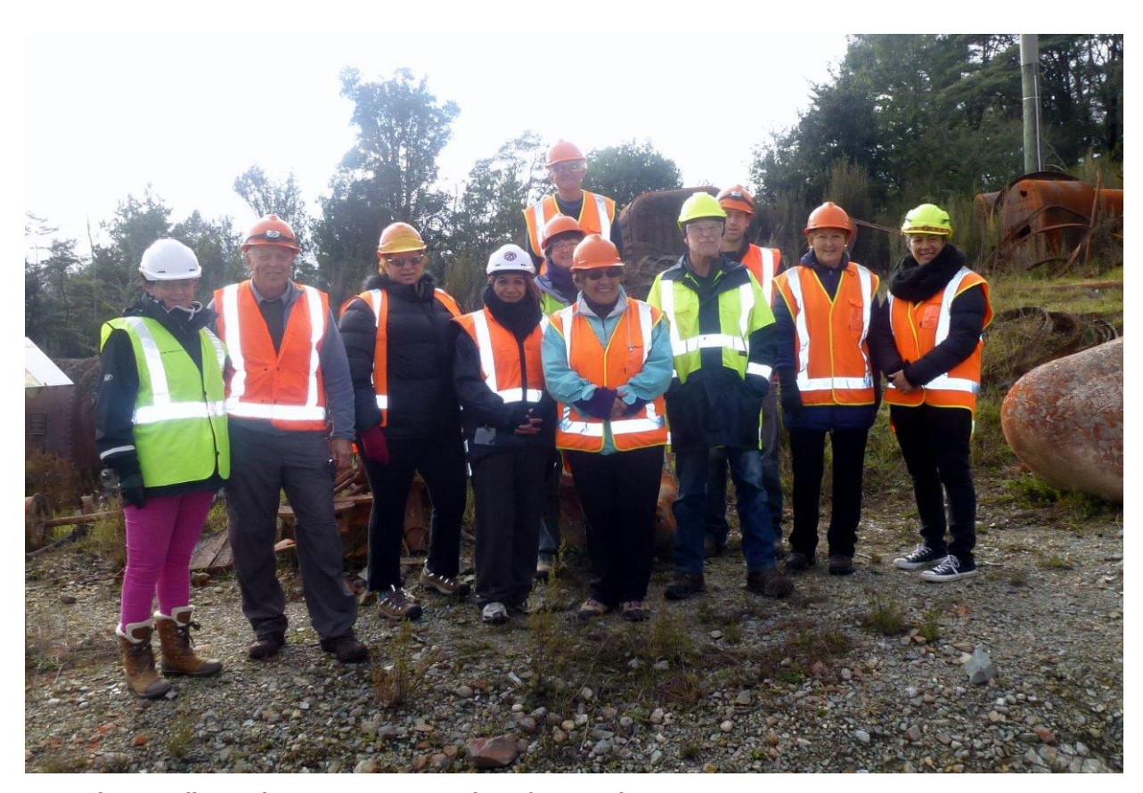
Nelson Marlborough Conservation Board, Reefton, April 2015

Royal Forest and Bird Protection Society of New Zealand representatives regularly attend Board meetings. Other organisations with occasional attendance include Fish and Game New Zealand, Federated Mountain Clubs of New Zealand, and Nelson Tramping Club.