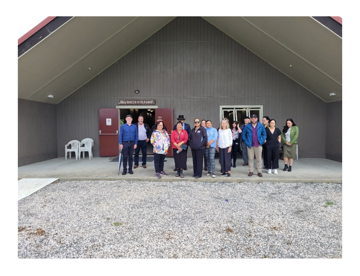
Photo: Northland and Auckland Conservation Board members, accompanied by DoC staff, outside marae at Te Hana Te Ao Marama Maori Cultural Centre, November 2022.