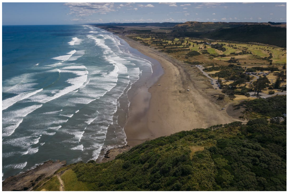
Muriwai Beach

The Board appealed to visitors to some of Auckland's most popular beaches this summer to avoid driving over sand dune areas. Currently in the Auckland region driving is permitted only on Karioitahi and Muriwai Beaches, with a short-term summer ban announced for Muriwai Beach. Both beaches are busy shared environments, with strict rules in place for vehicle users to ensure the safety of beachgoers and vehicle users alike. Board Chair Lyn Mayes explained that both beaches have particularly fragile dune systems and native biodiversity that needed to be protected; and asked visitors to please be mindful of this when out enjoying our beautiful beaches.