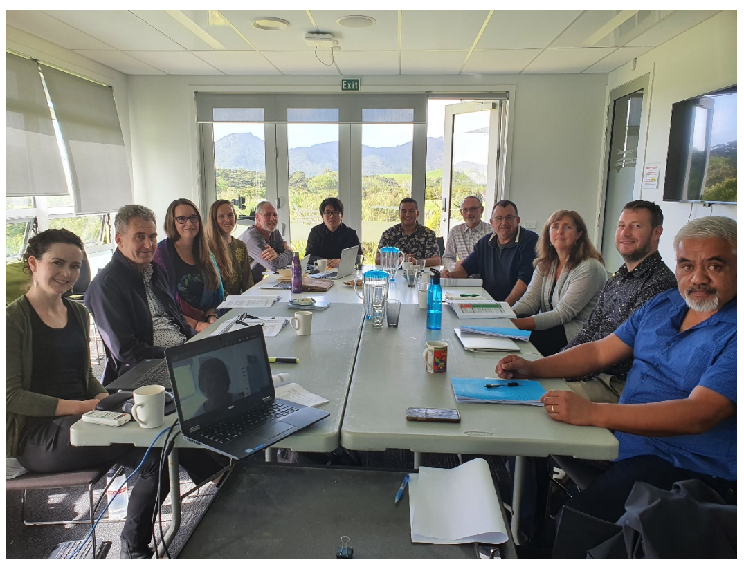
Board meeting at DOC Okiwi Office, Aotea/Great Barrier, May 2021