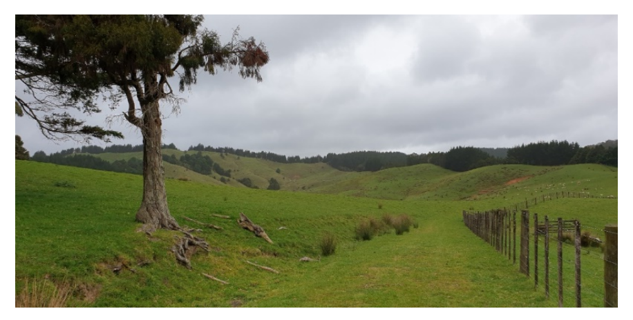
Dome Valley site, October 2020

In June 2021 Auckland Council approved the resource consent and the Board made clear its disappointment with this decision.