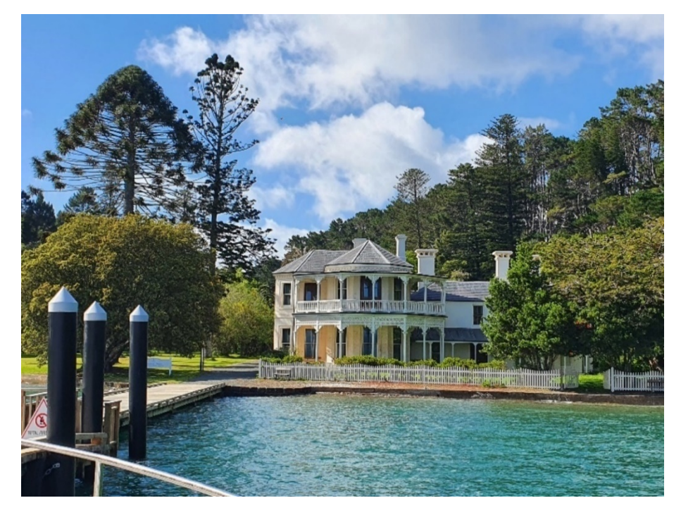
Mansion House Bay, Kawau Island, November 2020