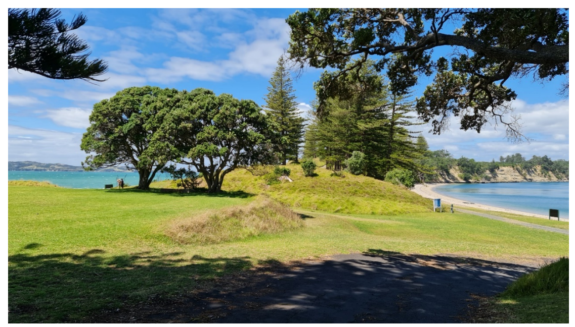
Motuihe Island, February 2021

Field trips were held to Kawau, Aotea/Great Barrier and Te Motu-a-Ihenga/Motuihe. Members of the Board also visited the Dome Valley to see the proposed site for the Waste Management NZ Ltd. landfill and conducted a workshop at Te Noho Kotahitanga Marae, Unitec.