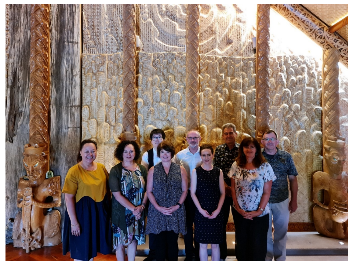
Wānanga at Te Noho Kotahitanga marae, Unitec, December 2020

In January 2021, members of the concessions sub-committee met with DOC staff for an induction and refresher training session on the Board's role in the Department's concessions processes.