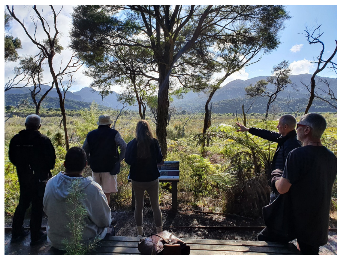
Board members visiting Kaitoke Wetlands, Aotea/Great Barrier, May 2021