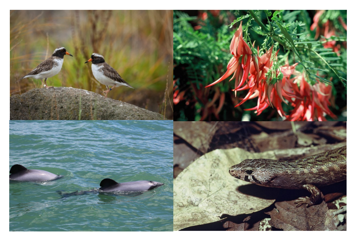
Shore plover/tūturuatu (photo: Sabine Bernert, DOC); Kōwhai ngutu-kākā/kākābeak (photo: Dick Veitch, DOC); Chevron skink/niho taniwha, Aotea/Great Barrier (photo: Dick Veitch, DOC); Māui dolphin (photo: University of Auckland/DOC)