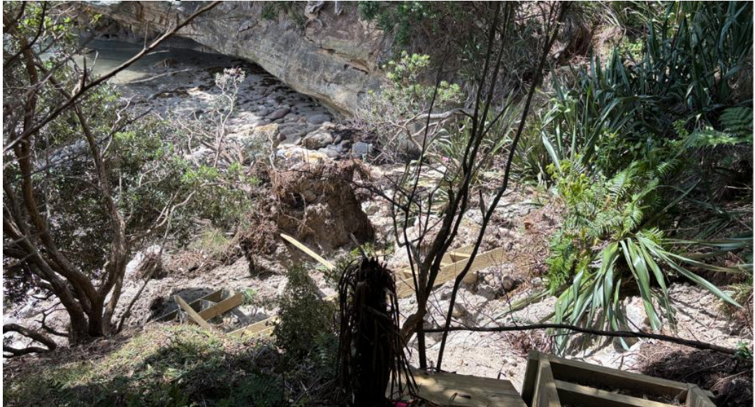
Landslide and track damage