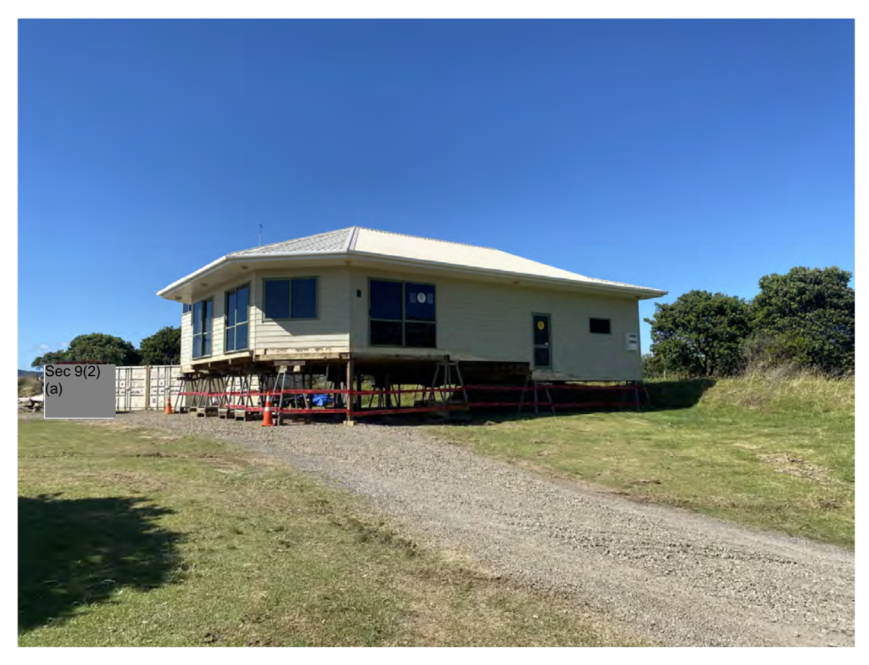
Figure 8 - Clubroom building currently on temporary stands at Buffalo Beach.