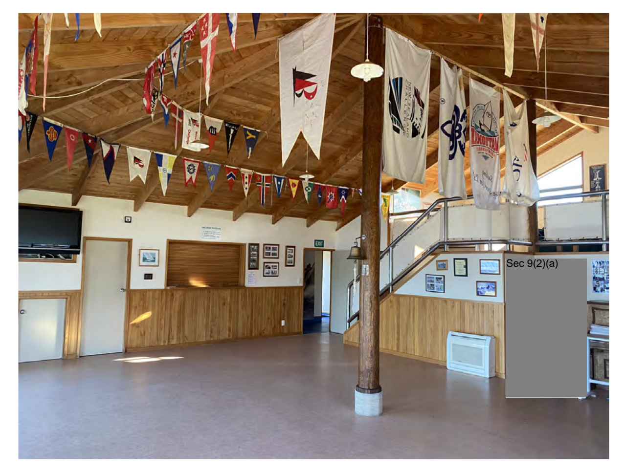
Figure 6 - Main function room.