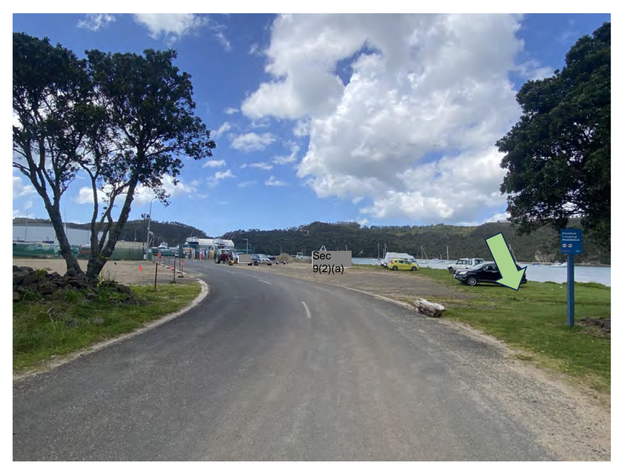
Figure 12 - Southern Reclamation and access road to the boat yard and ramp. Proposed building location as indicated by the arrow.