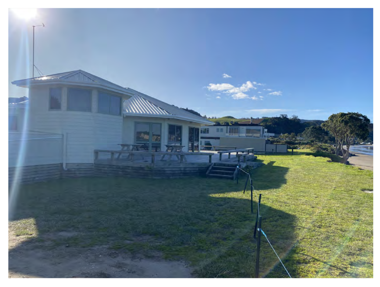
Figure 5 - Clubroom building at existing site immediately prior to the 2023 cyclone events.