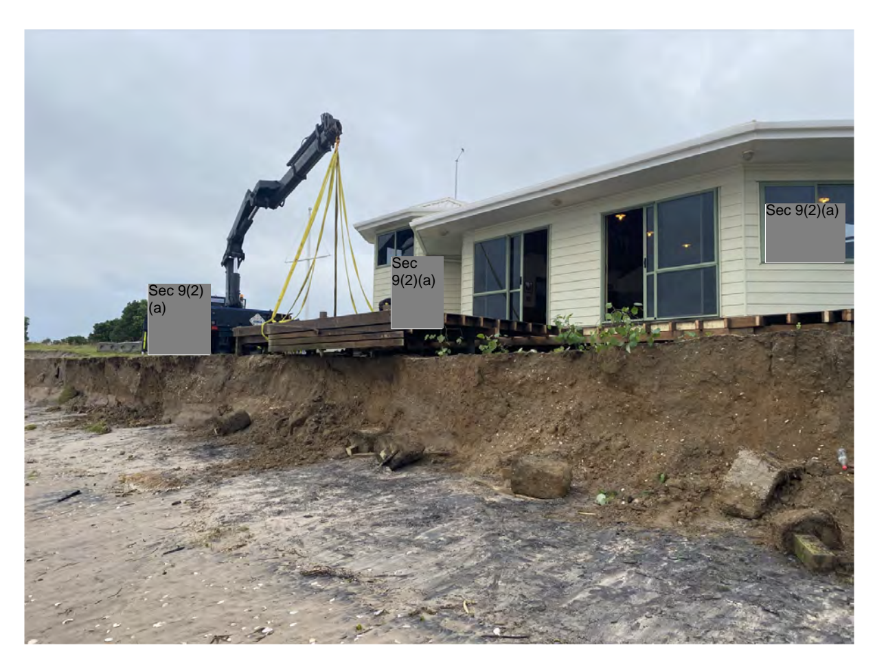
Figure 7 – Erosion and deck removal following Cyclone Hale.