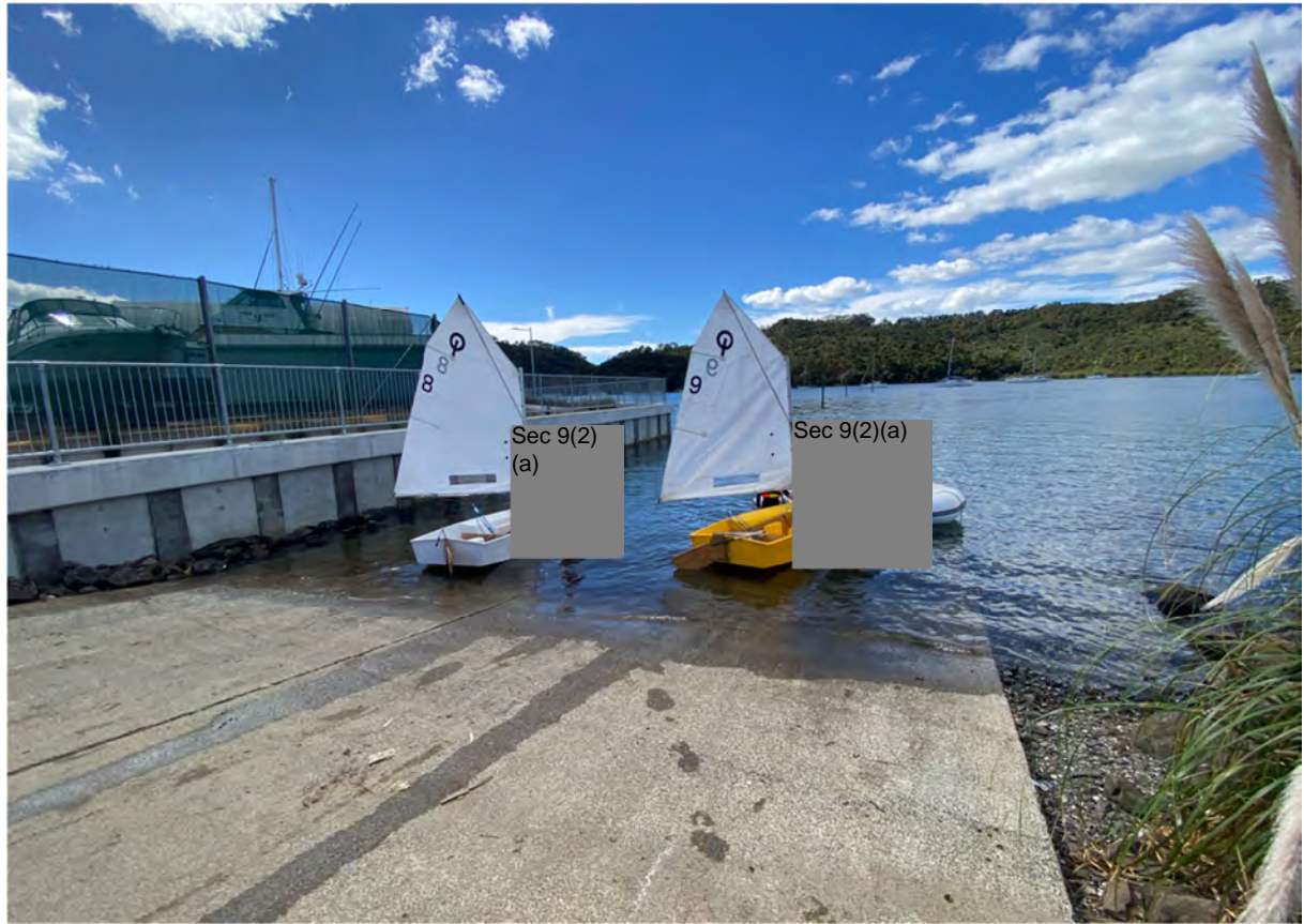
Figure 16 - Launching from the public boat ramp at Dundas Street.