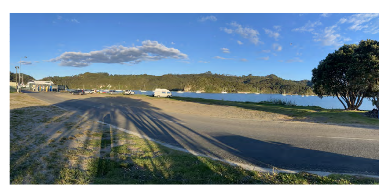
Figure 2 - Southern Reclamation and Dundas Street Reserve, looking east.

The Dundas Street site has been identified as the only suitable alternative in the area due to its proximity to the water, location close to the marina, zoning, and relatively low potential for impact on neighbouring properties and viewshafts. The Dundas Street site is reclaimed land which did not exist at the time the building was constructed in the late 1990s. Had it been available at that time, the Club would most certainly have sought permission to establish the clubhouse building in this location.