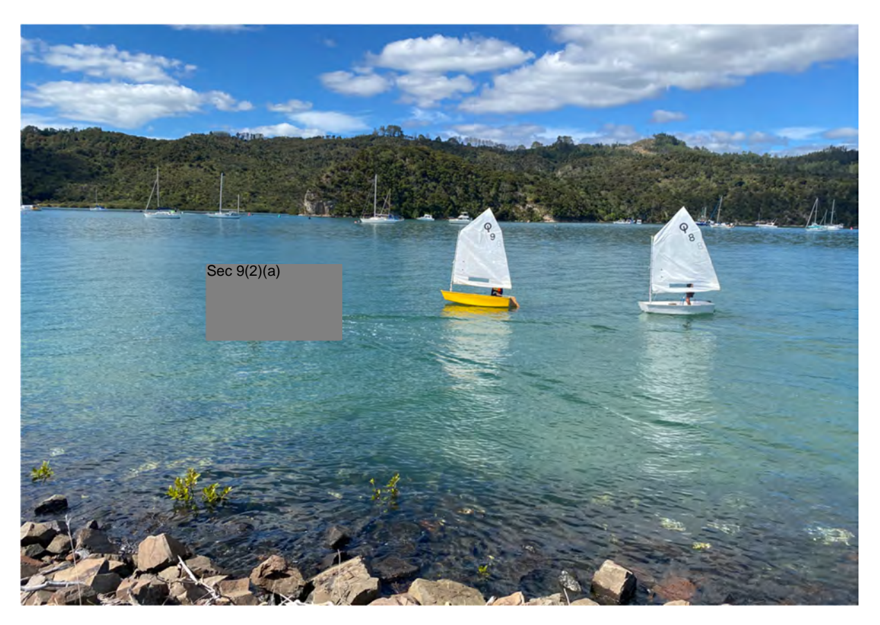
Figure 14 – Junior sailors in action immediately in front of the Dundas Street reserve.