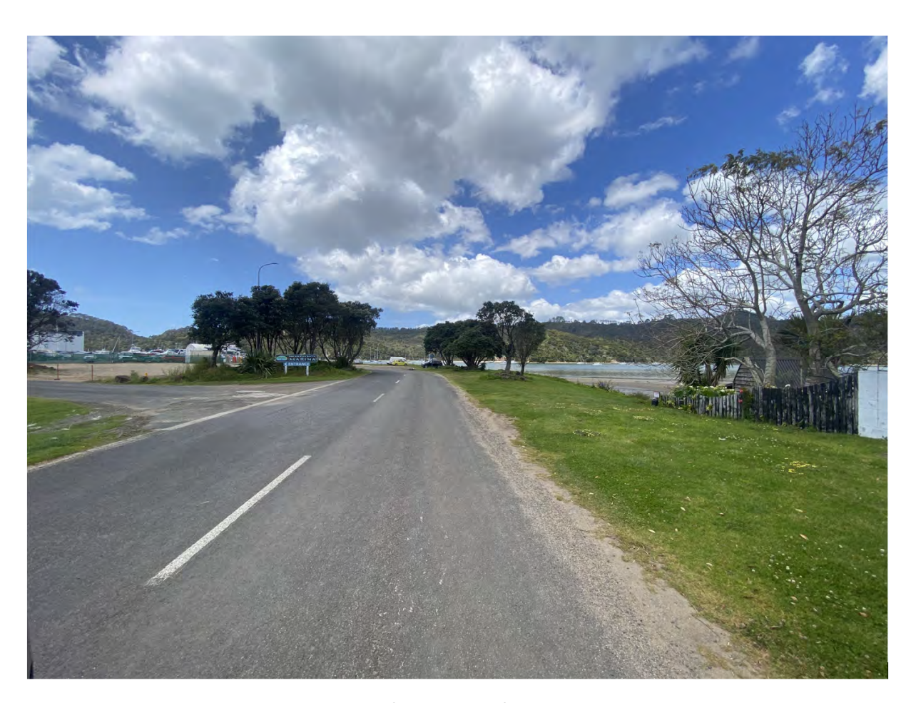
Figure 10 - Entrance to the southern reclamation from the end of Dundas Street.

A copy of the lease agreement is attached for reference.