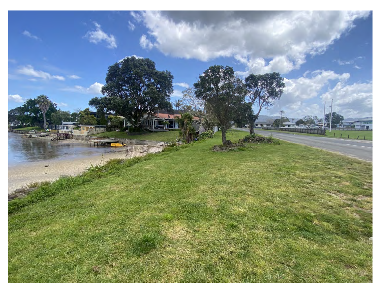
Figure 11 - Looking back at Dundas Street and the western end of the reserve. Lyon Park is on the right.