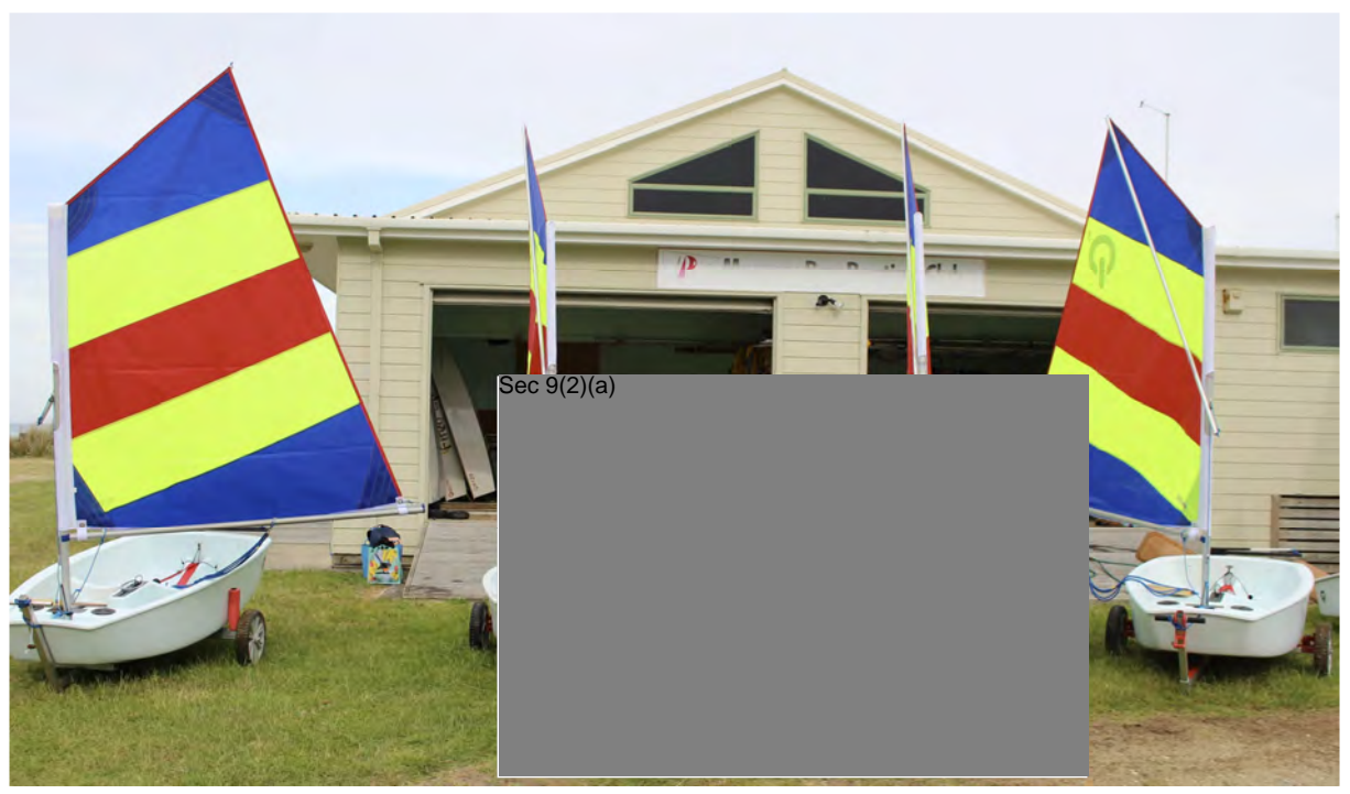
Figure 3 - Junior sailors

The Club is an incorporated society / not-for-profit organisation and all income generated from membership subs, regatta fees and functions is used to cover sailing equipment, coaching and other and club related running costs.