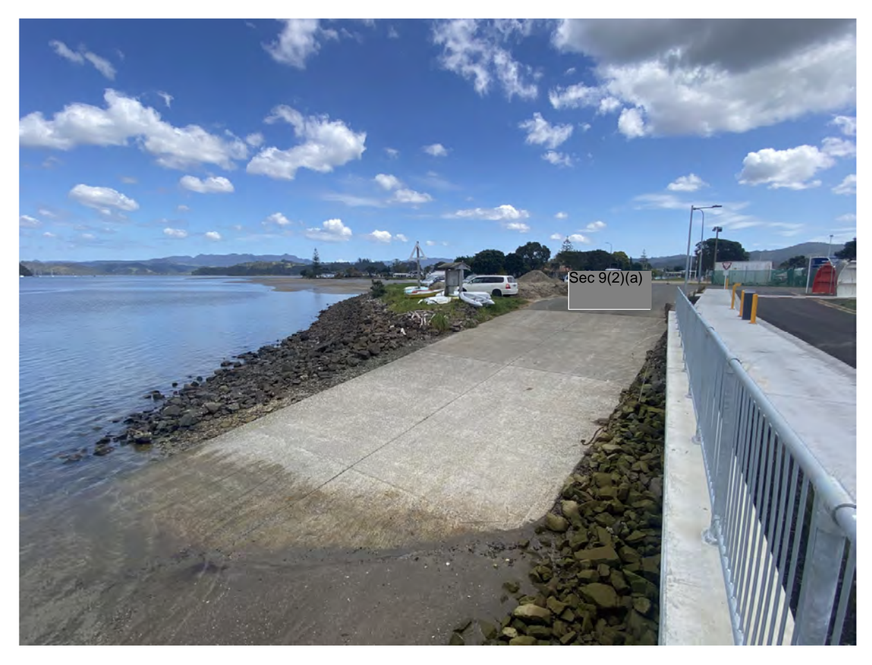
Figure 13 - Looking southwest with Dundas Street boat ramp in the foreground.