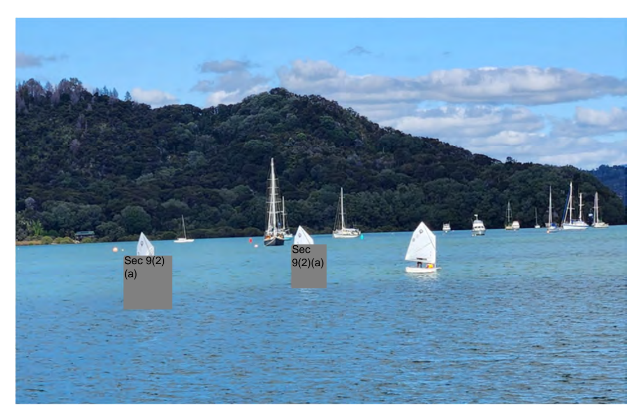
Figure 15 - Junior sailors in the harbour off the Dundas Street reserve.