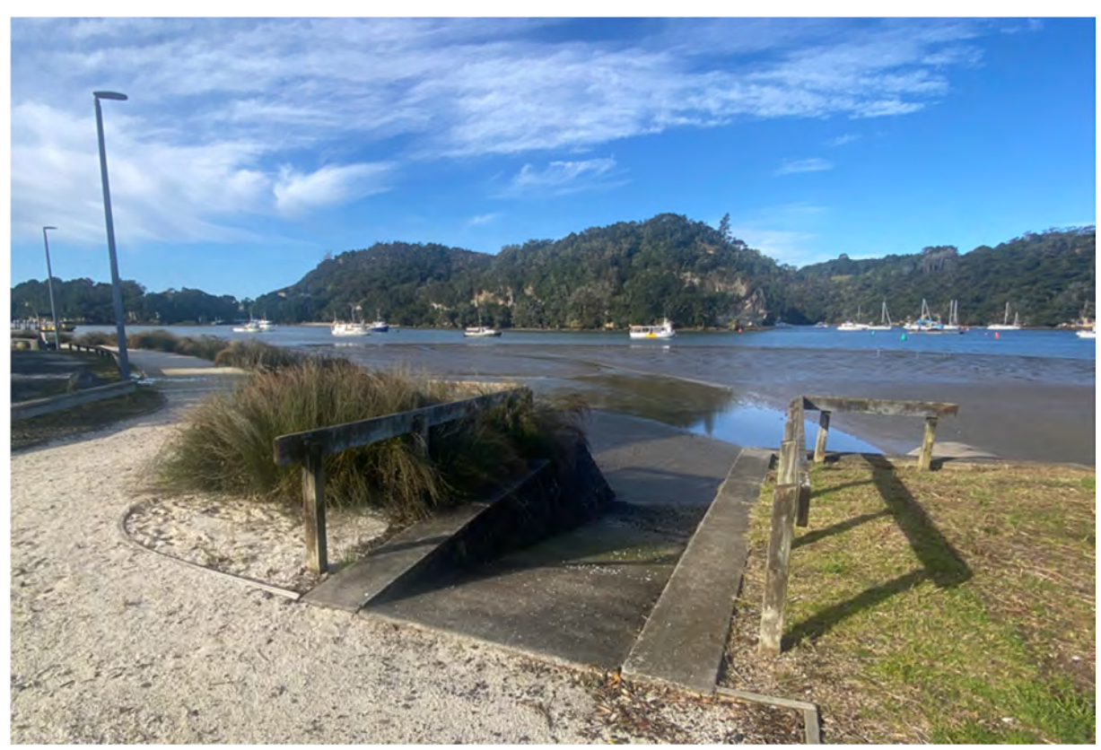
Figure 9 - Public kayak ramp on the northern reclamation.

As part of this application, the Club proposes to construct a dinghy ramp towards the western end of the reserve, to minimise potential conflict between the Club's activities and existing users of the public boat ramp. The dinghy ramp would be similar in style to the existing kayak ramp located on the northern reclamation. The Club will cover the cost of building and maintaining the ramp which would then be available for public use. Details of the ramp design would be agreed with DoC and would subject to appropriate resource consents from Regional Council.