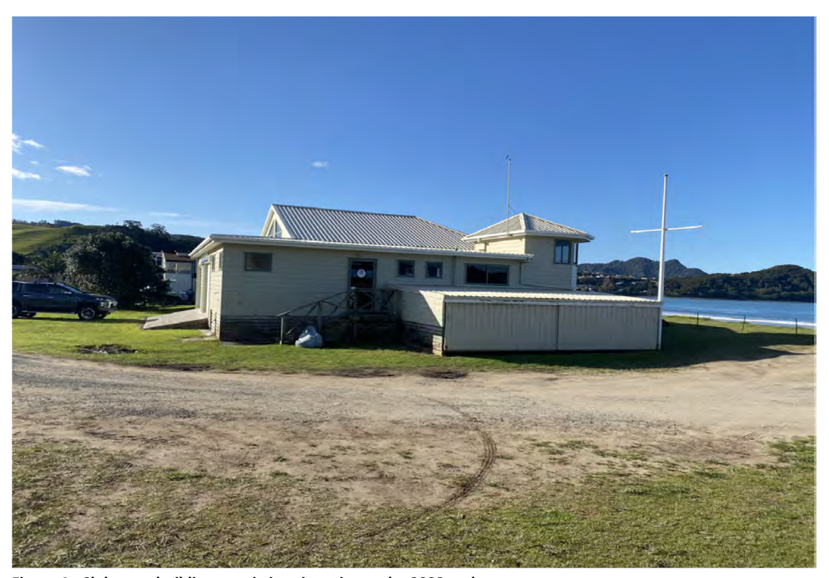
Figure 4 - Clubroom building at existing site prior to the 2023 cyclone events. Page 5 of 24

Note, all decks, ramps and the lean-to dinghy-store were removed during the building uplift and will need to be reconstructed once the building has been re-sited.