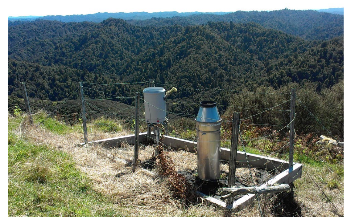
Location of current installation (all co-ordinates are in NZTM):