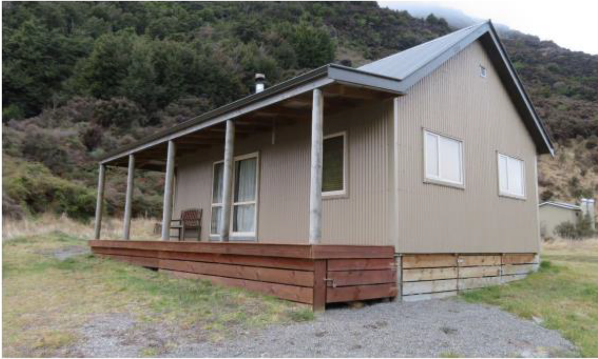
LKA Hut #1