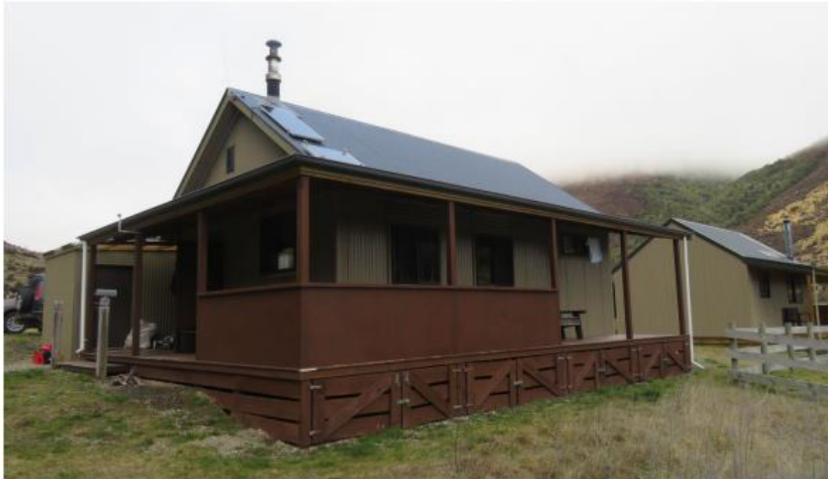
LKA Hut #2