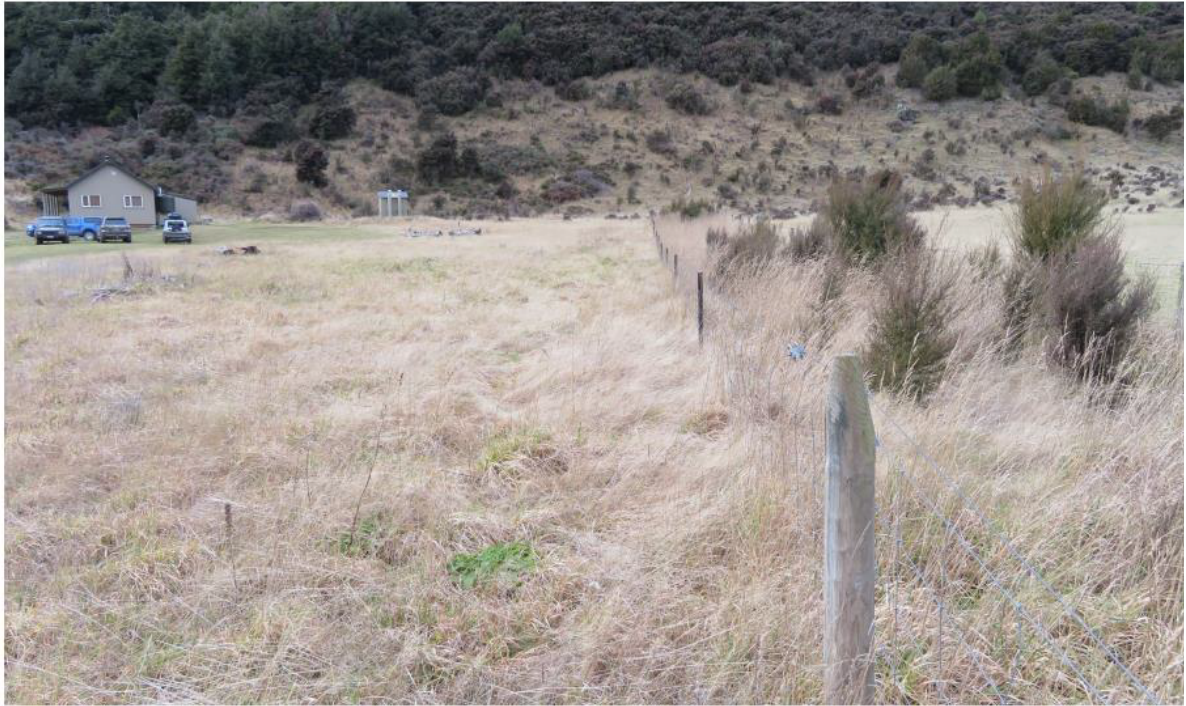
Planting Rear of Reserve