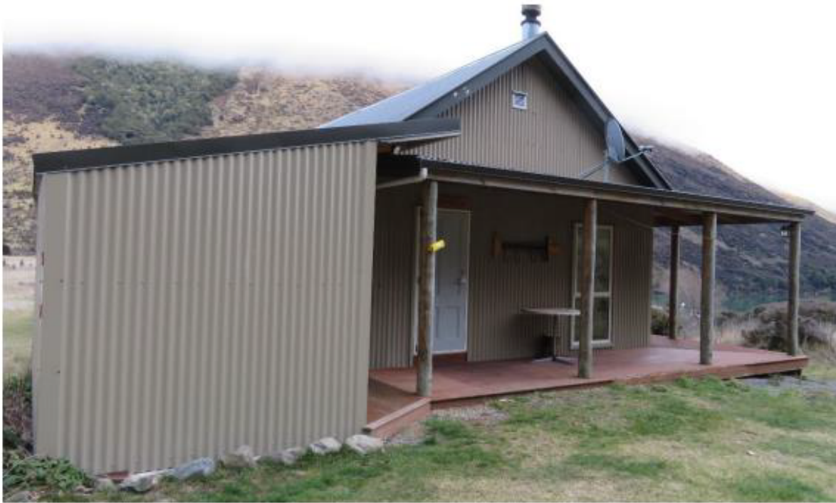
LKA Hut #1