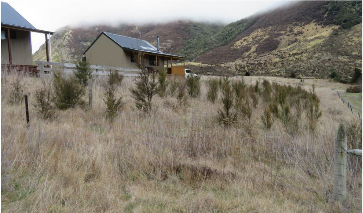
Planting North Side of Huts