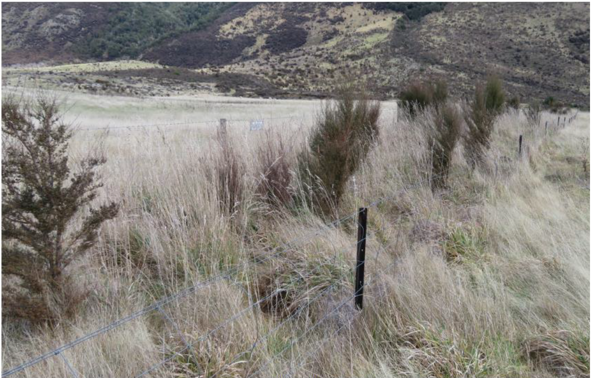
Planting Rear of Reserve