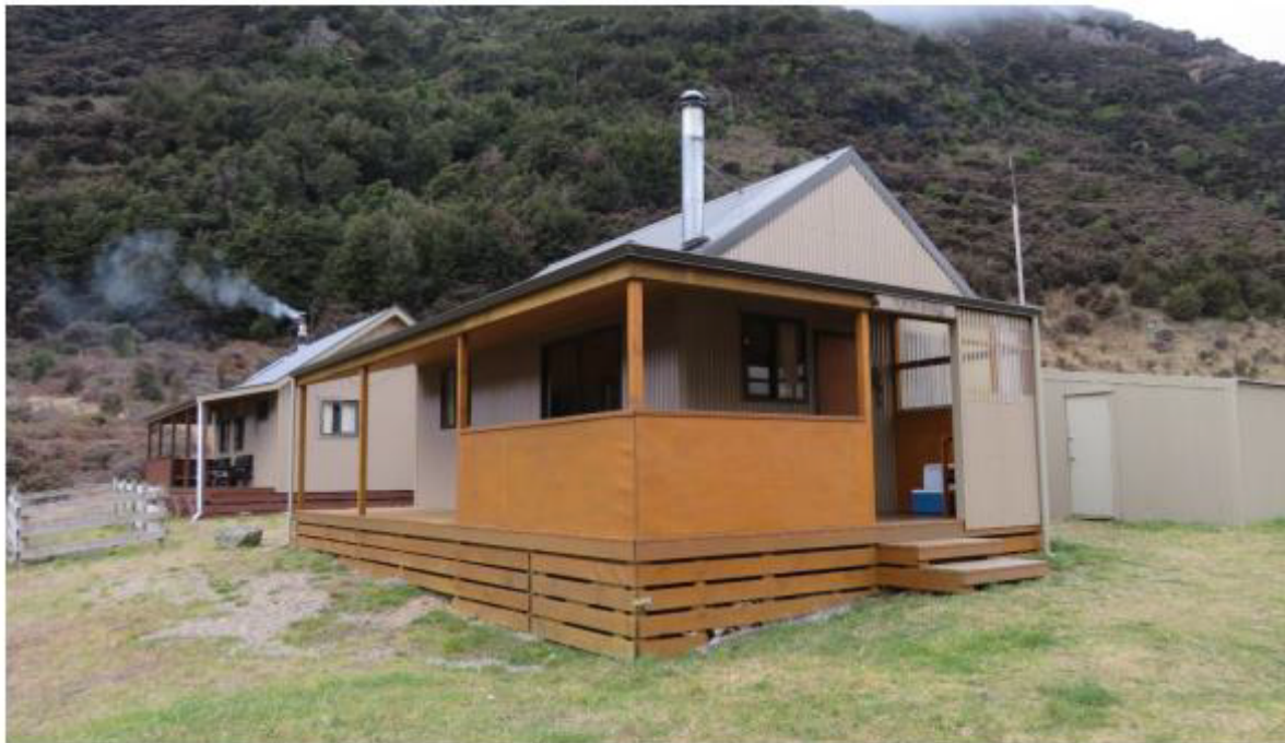
LKA Hut #3