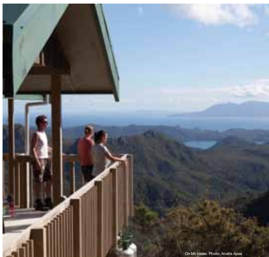
On Mt Heale.

P: 0800 21 21 25 E: info@greatbarrierlodge.co.nz www.greatbarrierlodge.co.nz