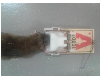
228.7 g male