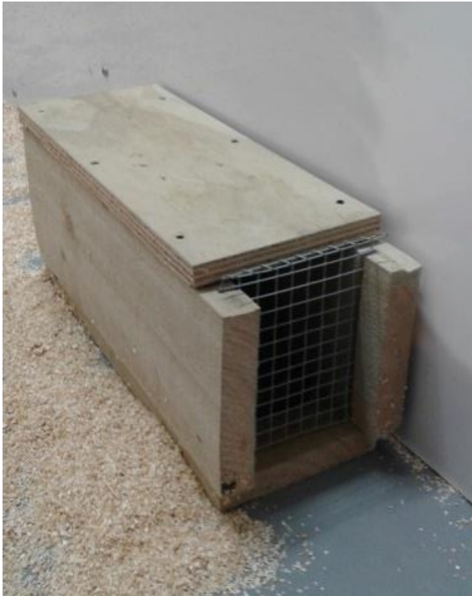
Figure 2. The Predator Free NZ wooden trap tunnel. A 50 × 50 mm entrance hole was cut in the mesh at the far end of the tunnel (not visible) and the mesh at the closed end of the tunnel was removable to allow access to the trap. The Victor® Professional rat trap or Modified Victor stoat and rat trap was set 1–2 cm into the tunnel from the closed end. Two tacks were nailed into the trap tunnel floor in front of the trap to prevent it being pulled forward by a rat or pushed too close to the entrance hole in the front mesh when deployed.

When a rat was struck by the trap, the time to loss of palpebral (blinking) reflex was measured to determine whether the trap had rendered the captured animal irreversibly unconscious within 3 minutes. For the trap to pass the NAWAC trap-testing criterion (2011) as a Class B trap, 10 of 10 rats needed to be rendered irreversibly unconscious within 3 minutes. Once irreversible unconsciousness was identified, a stethoscope was used to determine cessation of heartbeat.