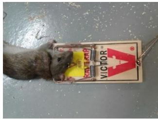
276.4 g female (fail)