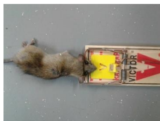
102.1 g female