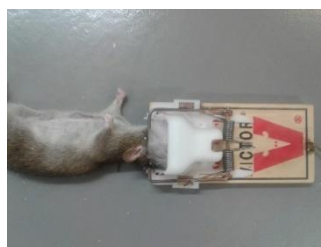
206.4 g female