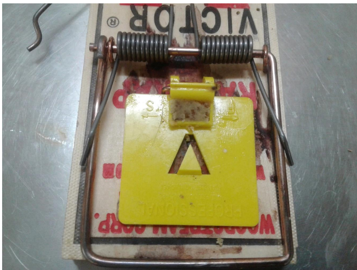
Figure 3. Baited unset Victor® Professional rat trap showing placement of bait in the purpose-made bait-well.

The traps were set in Predator Free NZ wooden tunnels and baited with either walnut paste, Nutella® or smooth peanut butter, applied in the purpose-made bait well near the pivot on the yellow treadle (Figure 3). Once set, the trap was placed in the tunnel so that the back edge of the trap was about 1–2 cm in from the rear mesh, so that there was enough room in front of the trap to allow a rat to fully enter the tunnel. Two tacks were nailed into the trap tunnel floor in front of the trap to prevent it being pulled forward by a rat or pushed too close to the entrance hole in the front mesh when the trap was placed in the tunnel. Testing started on 27 November 2018 and was completed on 9 December 2018.