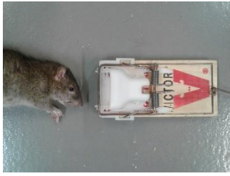
347.9 g male