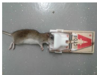
129.2 g female