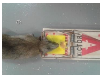
163.1 g male