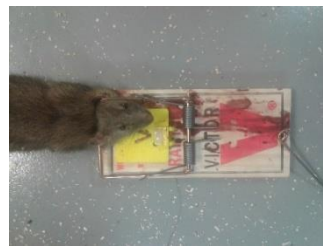
243.5 g male