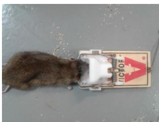
217.6 g male