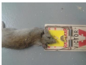
126.1 g male