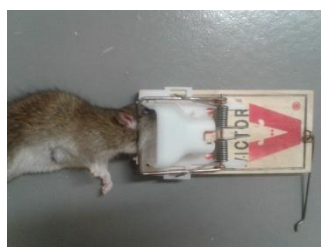
271.8. g male