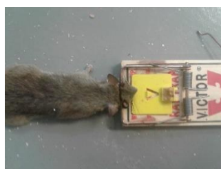
124.4 g male