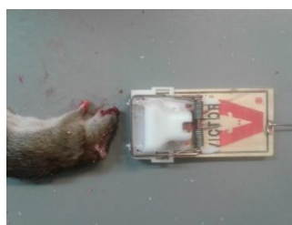
305.8 g male