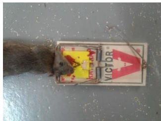
191.9 g male