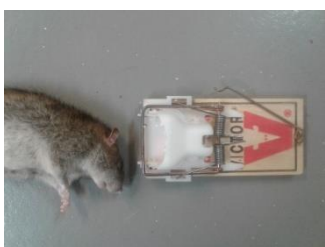
415.1 g male