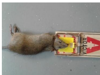
220.3 g male