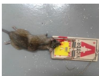
169.5 g male