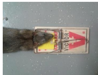
238.8. g male