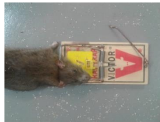
321.1 g female