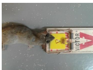
145.7 g male