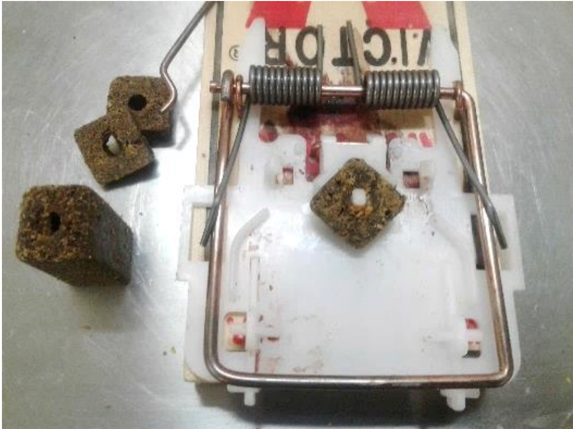
Figure 4. Baited unset Modified Victor stoat and rat trap showing method of baiting (shroud removed) with Mustelid and Cat lure block and slices.

The traps were set inside Predator Free NZ wooden tunnels as in tests 1 and 2. The trap was baited with a slice of Mustelid and Cat lure 3 smeared with either a small quantity of bacon fat or smooth peanut butter on the upper surface of the lure (Figure 4). Testing was carried out from 13 to 28 February 2019.