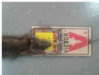
182.3 g male