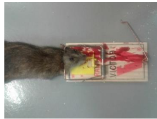
338.1 g male