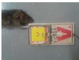
277.3 g male (fail)