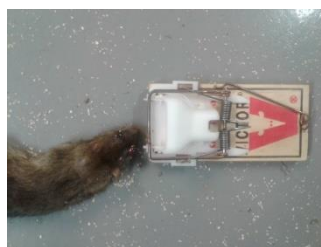
295.8 g male