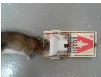
240.3 g male