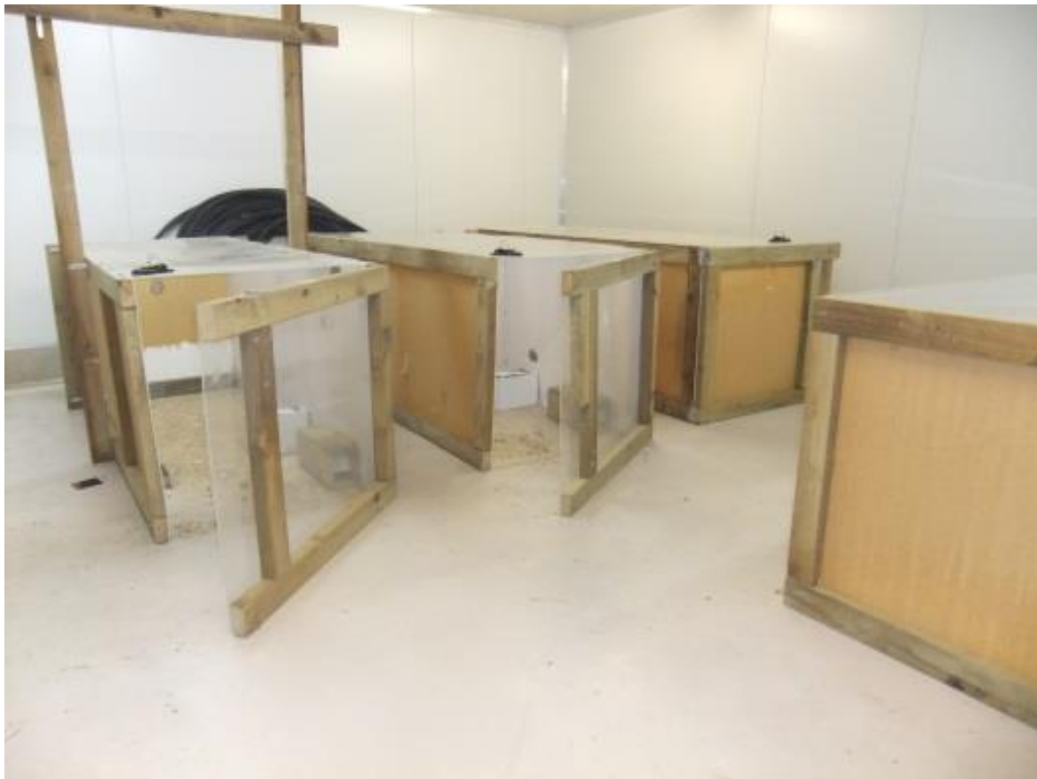
Figure 1. The four arenas used for trap testing. Rats were provided with a nest box, had free access to water, and were fed with standard rodent pellets (ProLab RHM 1800 LabDiet, PMI Nutrition International, MO, USA). Two arenas are shown with Predator Free NZ wooden trap tunnels in place.

Wild-caught rats were acclimatised to captivity in cages before being transferred to test arenas for the trap testing (Figure 1). Rats were confined individually in each arena and tested in a free-approach test during late afternoon or evening. In each arena, a trap was set in a Predator Free NZ wooden tunnel (Figure 2).