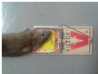
179.8 g female