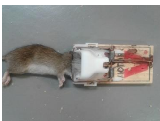
150.9 g female