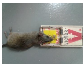
137.1 g female