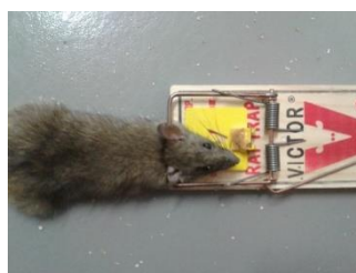
162.9 g female