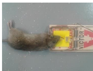
105.5 g female