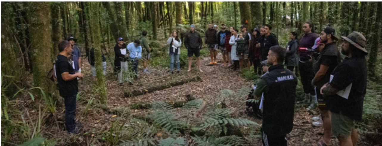
He wānanga kei te Kura Reo o te Taiao, Rotorua.