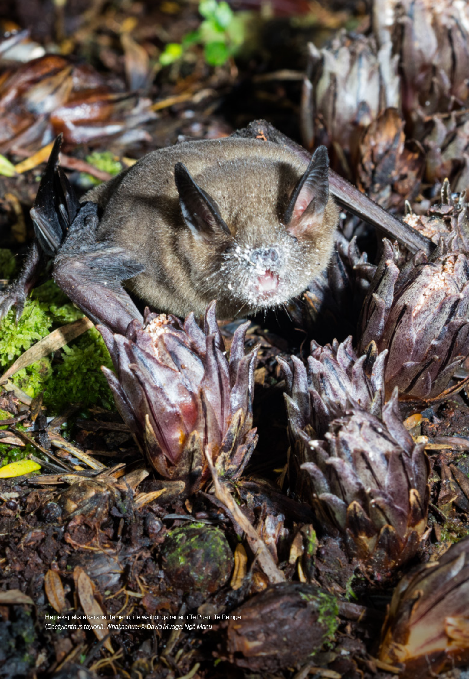
He pekapeka e kai ana i te nehu, i te waihonga rānei o Te Pua o Te Rēinga ( Dactylanthus taylorii).