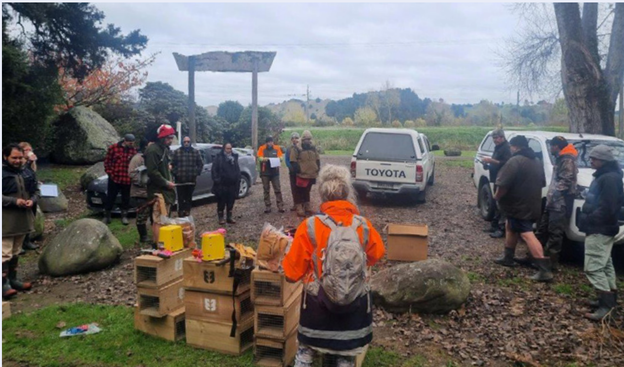
He tāngata e ako ana i te hōhonutanga atu o ngā mahi hopu, i tētahi akoranga hopu kaikonihī i Taumarunui.