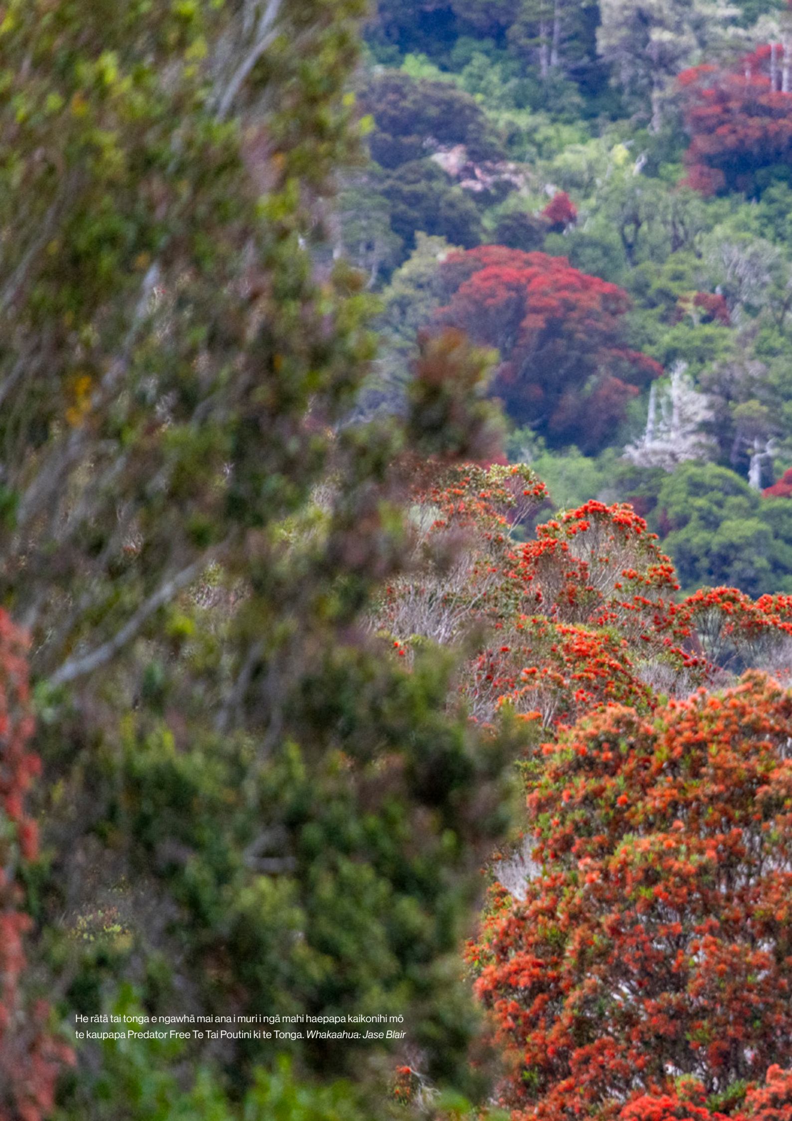
He rātā tai tonga e ngawhā mai ana i muri i ngā mahi haepapa kaikonihī mō te kaupapa Predator Free Te Tai Poutini ki te Tonga.