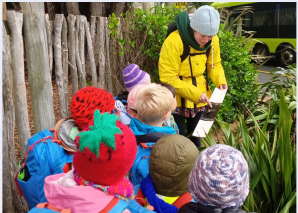
Ētahi tamariki i Te Motu Kairangi e whakatika ana, e tautiaki ana i te tomo aroturuki.

Ko tā te noho kaikonihī kore he panoni mārika i ngā ngahere, i ngā tāone nui, i ngā tāone iti me ngā pāmu o Aotearoa kia noho hei wāhi e ora ai ngā tupu me ngā kararehe māori o tēnei whenua. Mā konei hoki ka tautokona, ka whakatinanatia hoki Te Mana o te Taiao – Aotearoa New Zealand Biodiversity Strategy (ANZBS) . Engari kei tua noa atu te pānga te whakatutukitanga o Kaikonihī-Kore 2050 i te oranga kanorau koiora anake – ko te tūmanako ka kite ngā tāngata katoa o Aotearoa, ngā hāpori, me te ōhanga i ōna painga whakaumu, ahakoa ā-kiko, ahakoa ā-wairua. Ā, ehara i te mea me tatari tātou ki 2050 rā anō kia kitea ai aua painga – kei te mōhio tātou kei te kitea e te tini o ngā tāngata o Aotearoa i ngā painga o ngā kōkiri kaikonihī-kore i roto i tō rātou ao ia rā.