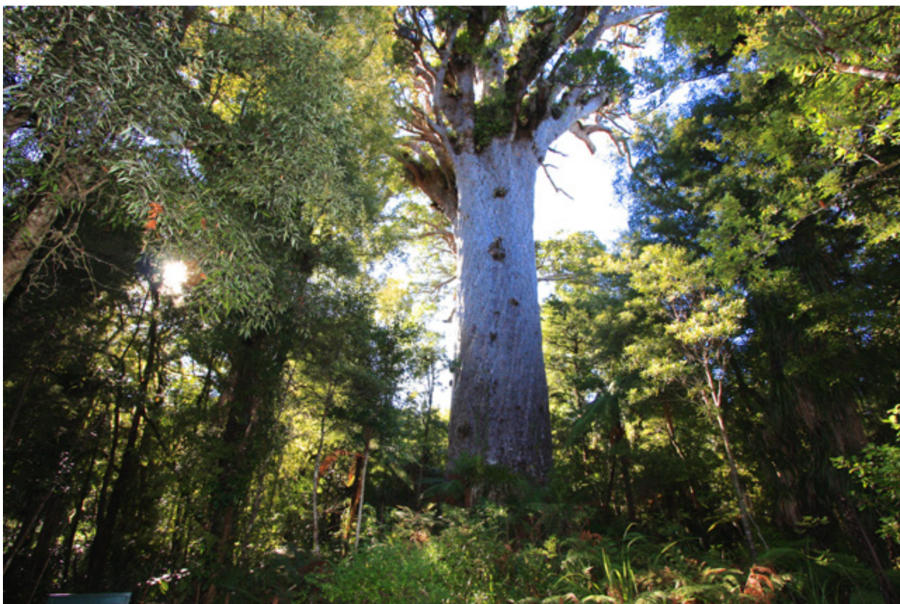
Tāne Mahuta, Te Ngahere o Waipoua, Te Tai Tokerau.

Ko ngā momo e whakakekotia nei i roto i Kaikonihi-Kore 2050 ētahi o ngā kaikonihi urutomo tūkinō kaha rawa i te kanorau koiora māori o te motu. 7 Hei te whakawhānuitanga o Kaikonihi-Kore 2050 ki te motu katoa he mea hira kia rurukutia ngā mahi ki ērā atu kaupapa ā-motu e ārai nei i ētahi tau tūkinga, pēhanga pūnaha hauropi pērā i ngā kaikatikati rau rākau, pēnei i te tia, me te nanekoti kia tino eke ai ngā painga kanorau koiora ka taea i muri i aua haumitanga me aua kōkiri, ki te taumata tiketike rawa ka taea.