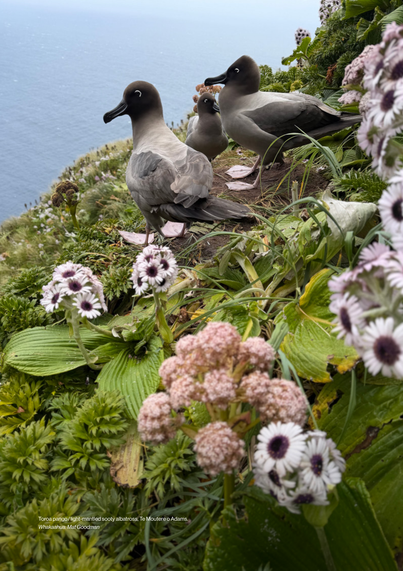
Toroa pango / light-mantled sooty albatross, Te Moutere o Adams.