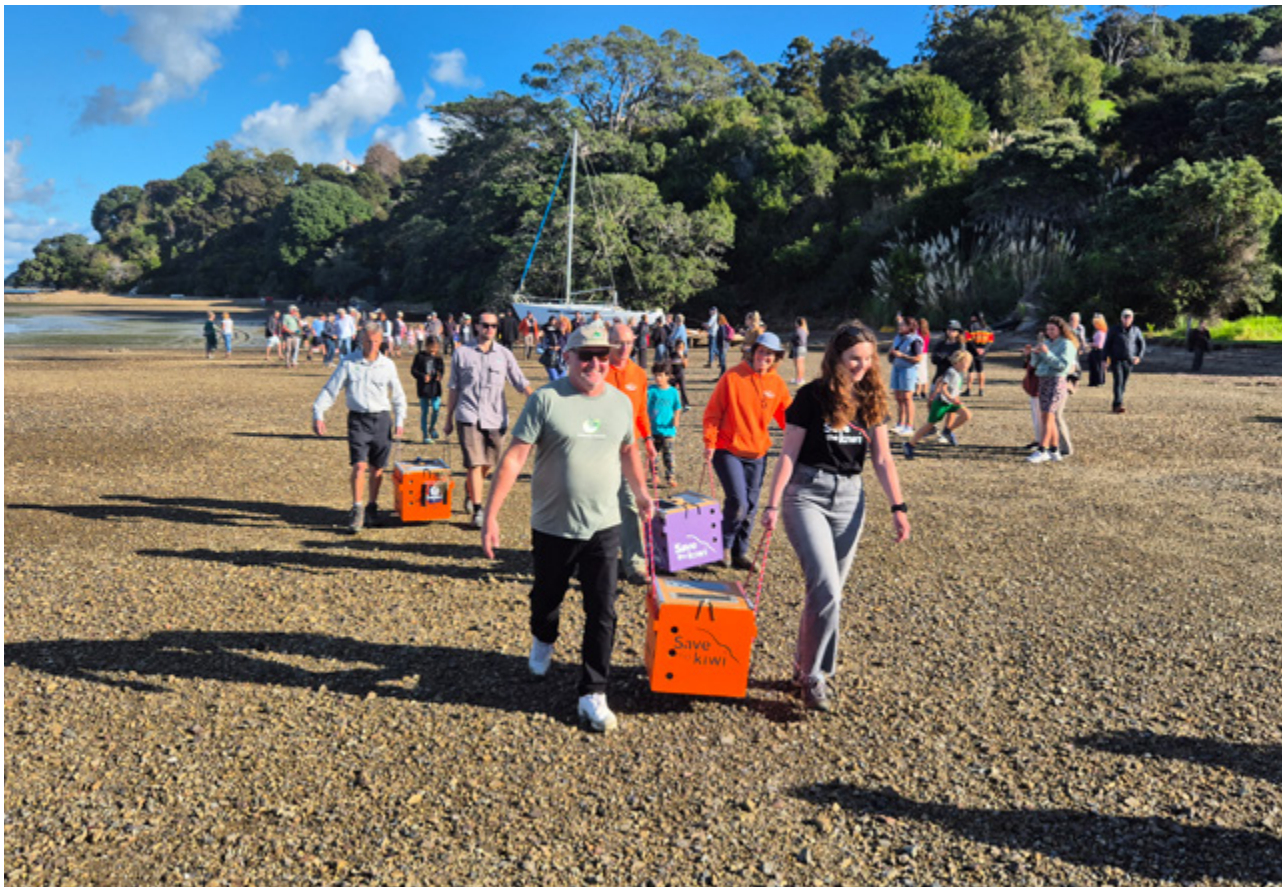
Te kawe kiwi ki tētahi kāinga hou ki Te Moutere o Waiheke.