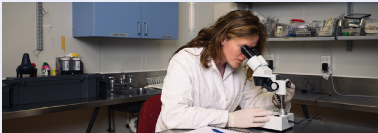
Te pūtahi rangahau Zero Invasive Predators, i Ōtautahi.