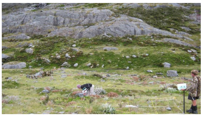
Zora, Landsborough, 1999 (top) compared with 2012 (bottom).