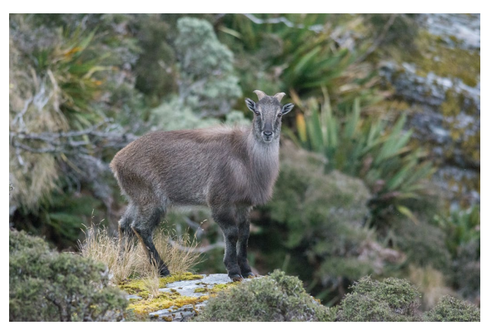
Juvenile tahr.

For more information: www.doc.govt.nz/tahr-control-operations