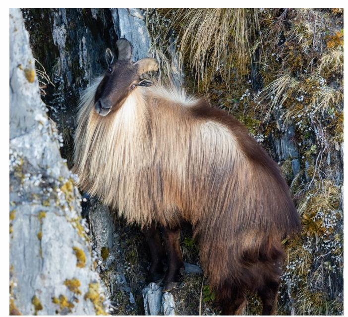
Bull (male) tahr.

Himalayan tahr (Hemitragus jemlahicus) are large goat-like animals, native to the central Himalayan ranges of India and Nepal.