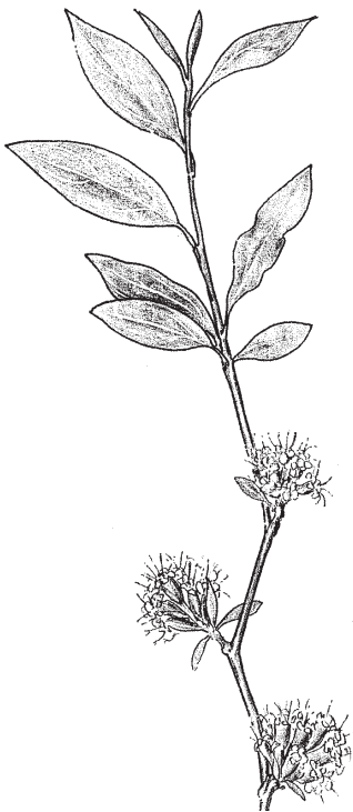
Sketches not to scale