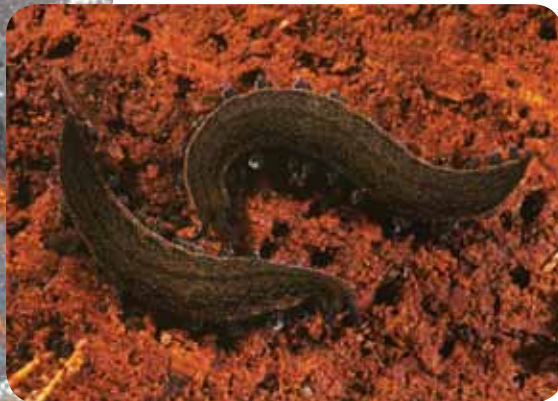
Peripatoides sp. 'Mt Peel'