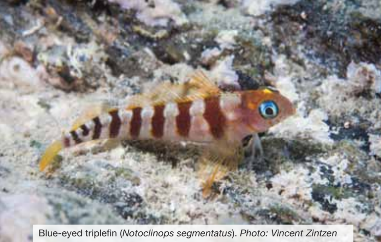
Blue-eyed triplefin ( Notoclinops segmentatus ).