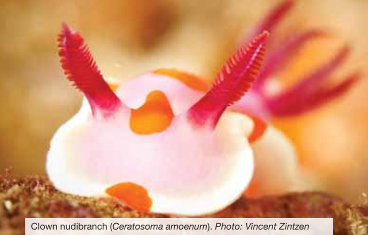
Clown nudibranch ( Ceratosoma amoenum ).