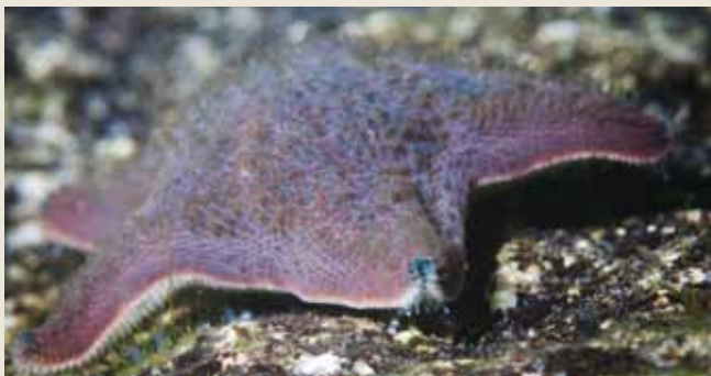
Cushion star ( Patiriella regularis ).

The Department of Conservation manages Te Paepae o Aotea (Volkner Rocks) Marine Reserve. To uphold the values of the marine reserve surveillance and enforcement is undertaken by DOC with the assistance of others. Failure to comply with the Marine Reserves Act, 1971 may result in prosecution.