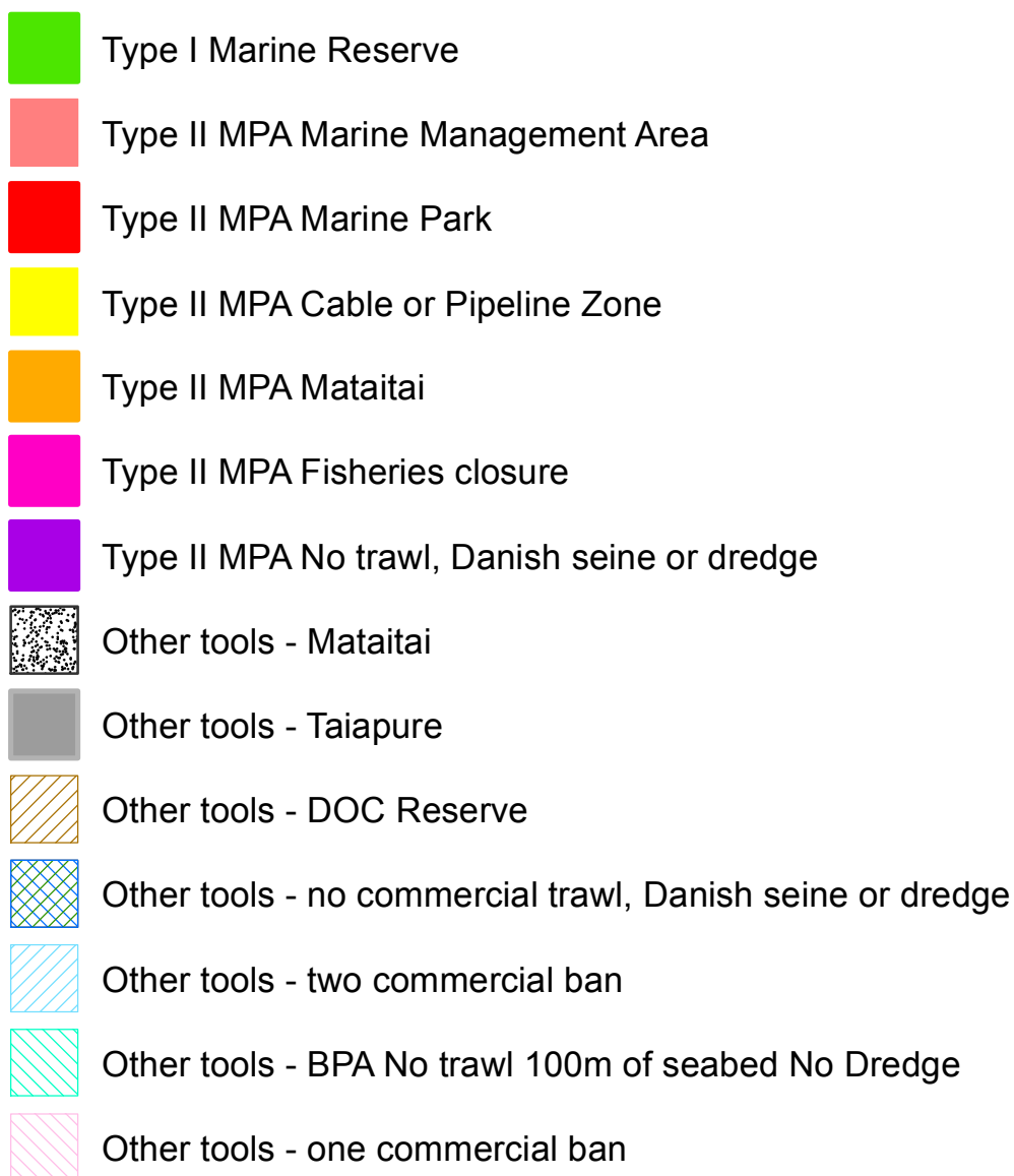
APPENDIX 7. LEGEND FOR MARINE MANAGEMENT TOOLS.