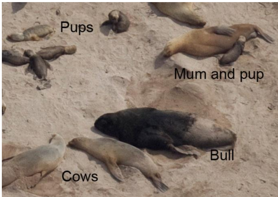
Figure 1: Age classes of New Zealand sea lions

Detecting sea lions from aerial photos was a function of both the quality of the photos and the terrain encountered. Sea lion pups were easily detected on the sandy beaches preferred for pupping, but were less visible when they moved into the adjoining grass areas. Poorer quality photographs were usually characterised by low contrast between the sea lions and substrate, reducing the ability to determine the age class of animals. The age classes of interest were pups and non-pups. Pups were typically small and dark, with a lighter area on the head; adult females were larger and pale with a streamlined shape, while adult males (bulls) were larger again and darker than females, and had thick necks and a distinctive shape that was different to other age classes ( Figure 1 ).