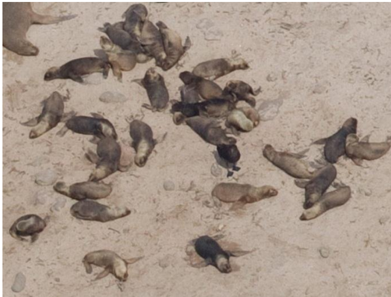
Figure 3. A pile of New Zealand sea lion pups on Sandy Bay Beach.

More work is desirable to understand the reason for the disparity between the Sandy Bay ground count and the one low aerial estimate, but the only plausible explanation would appear to be that pups were missed because they were hidden deep in puppy piles. It is clear from the ground count undertaken on that day that all pups at Sandy Bay were still on the beach and had not moved on to the grass sward adjoining the beach, where they may have been more easily missed because of poor contrast. We had thought that by using photographs taken directly overhead the potential for underestimating pups in piles would have been greatly reduced, as the pups do not appear to be more than a two or three pups high at the most (Figure 3). Certainly, the use of multiple counters and analysis of four separate photographic runs taken on the beach that day provided remarkably consistent results.