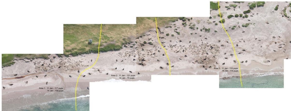
Figure 4. Sandy Bay, Enderby Island, showing areas where sea lion pups were concentrated over four days from 11 to 14 January 2012. While numbers of pups were reasonably consistent in Areas 1 and 3, there was a substantial difference between the number counted on 11 January (131) and that counted on 14 January (70).

Areas 1 and 3, there was a substantial difference between the number counted on 11 January (131) and that counted on 14 January (70). If photographs were taken over three or four days, as happened in this study, it is likely that at least one aerial count taken during that period would be comparable to a mark-recapture estimate. Certainly, the maximum count obtained during this study was within 1 and 2% of the mark-recapture estimates for Sandy Bay and Dundas Island, respectively.