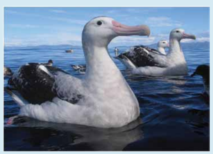
Gibson's albatross and Cape petrels are some of the subjects covered by the New Zealand NPOA.

Although it's called the National Plan of Action, it is part of a wider international move towards responsible fishing. Countries that have developed their own NPOAs include Argentina, Australia, Brazil, Canada, Japan, USA, and Uruguay. Some focus only on longline fisheries at this stage, but others (like New Zealand and South Africa) are more inclusive.