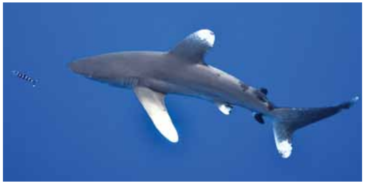
An oceanic whitetip shark, clearly showing how it got its name.

If you can't remove hooks or all of the netting from a protected animal, leave it with the smallest souvenirs possible: cut the snood as close as you can to the hook, and remove as much net as possible.